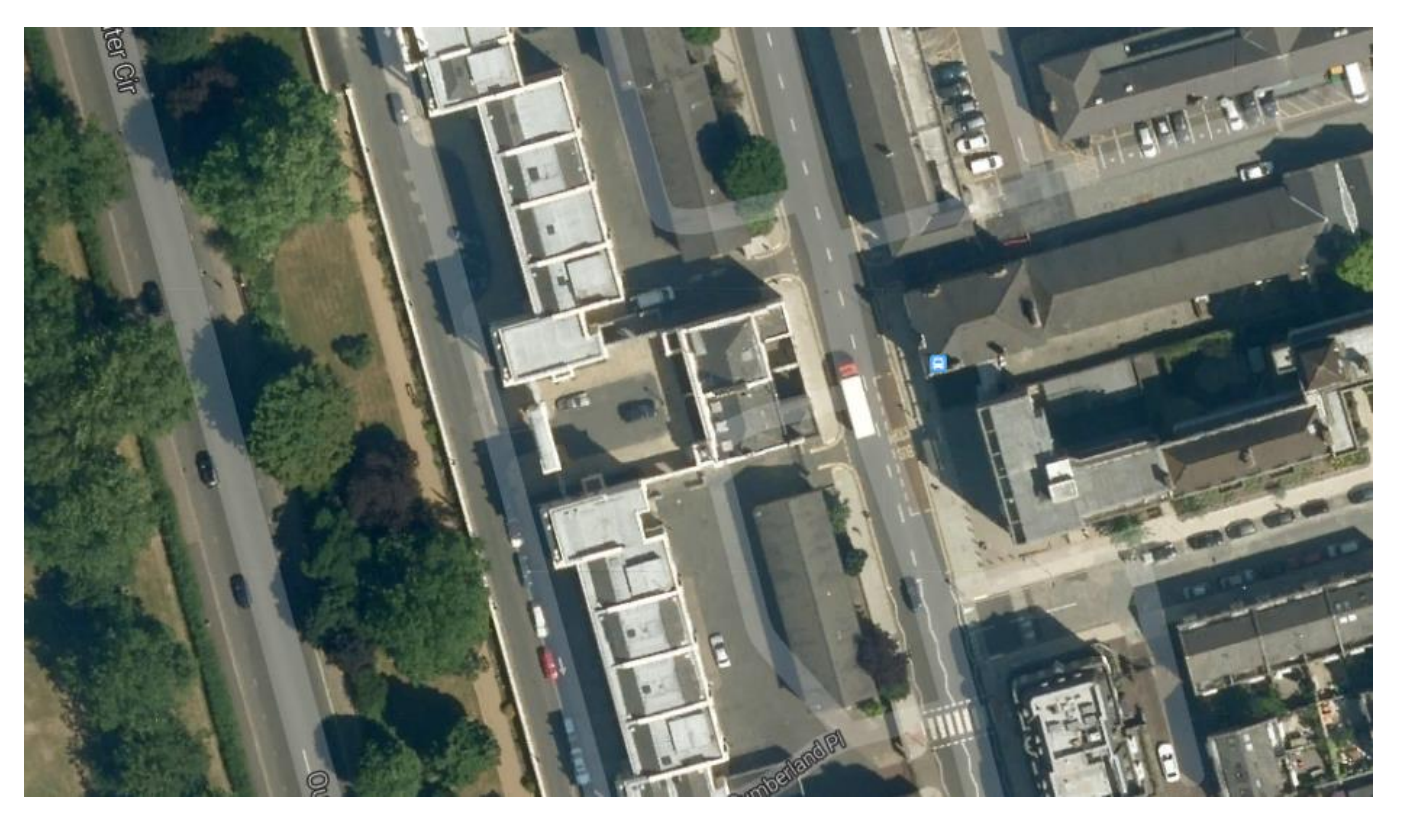
Figure 1 - Site Location Plan