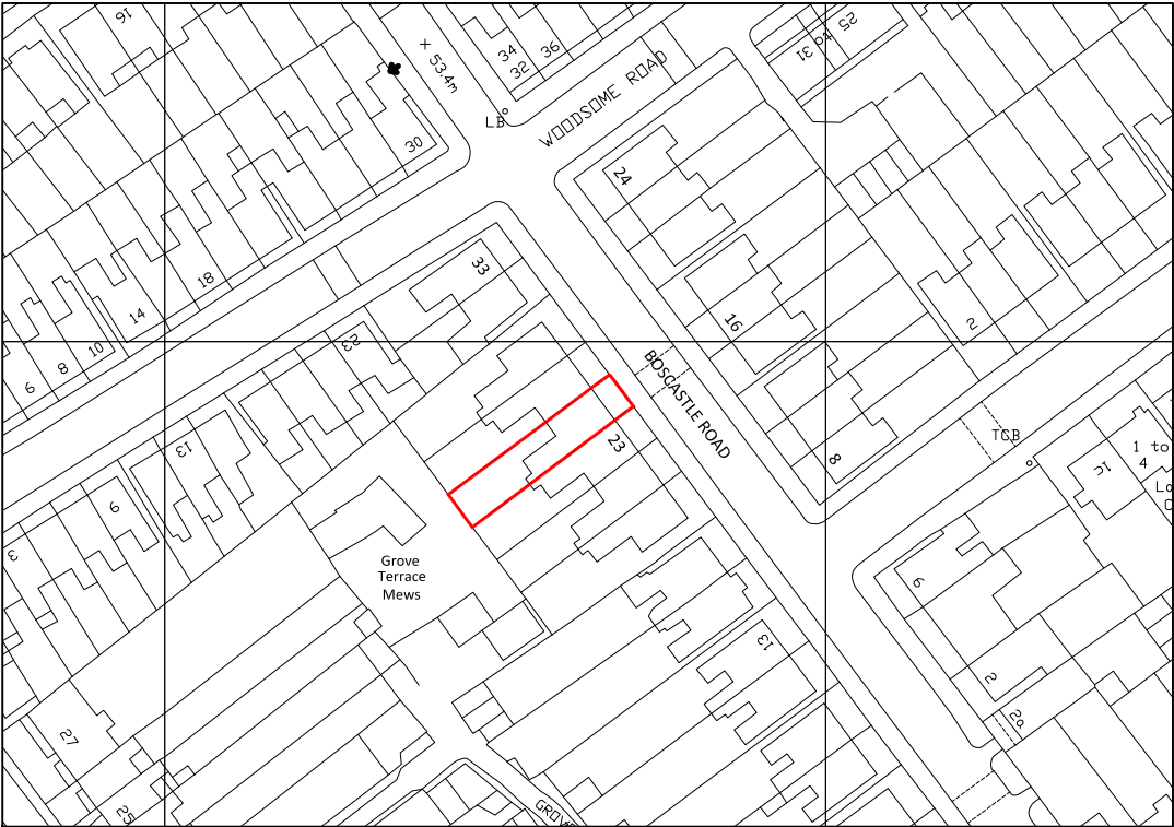
1 OS MAP 1:1250