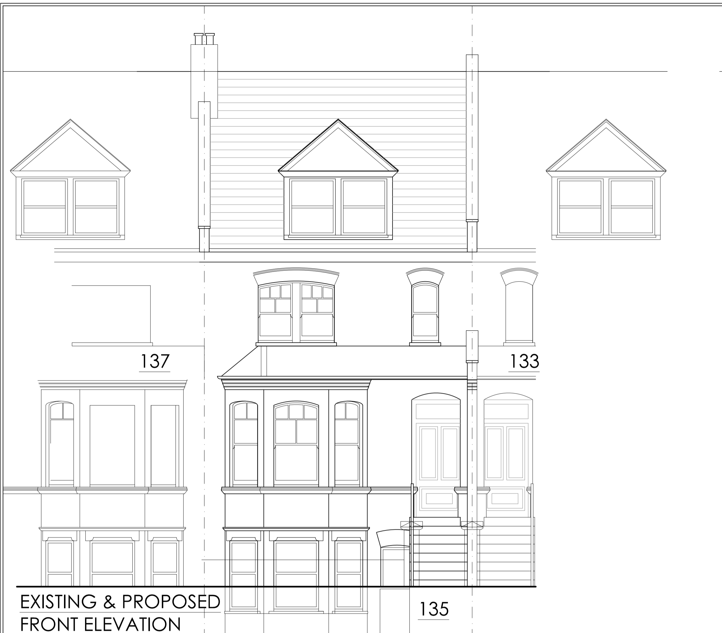
EXISTING & PROPOSED FRONT ELEVATION