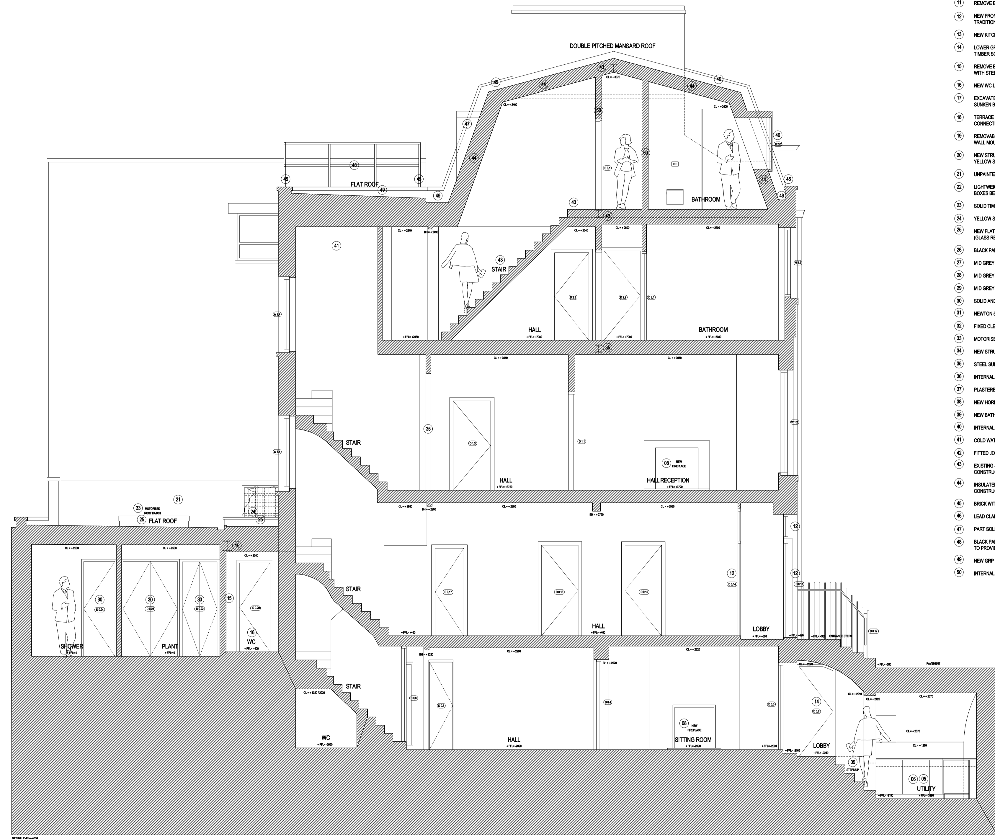
02 PROPOSED LONG SECTION 02 Scale 1:50 (@ A1 SIZE)