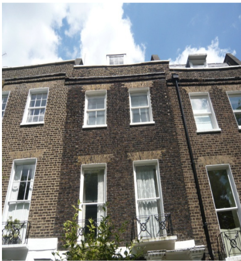
Front Elevation, (Original windows & window frames in fair conditions)