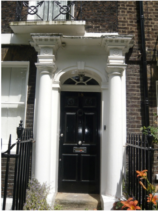
Front Elevation, Main building entrance