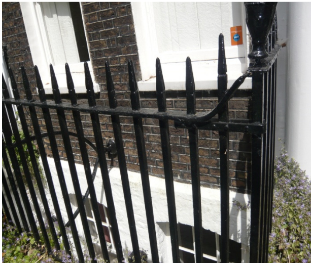
Metal Rails to front Light Well