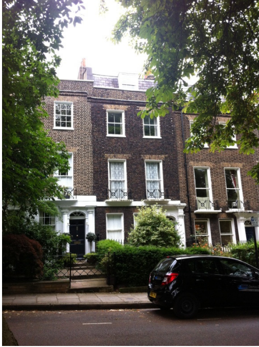
Front Elevation, View from Highgate Road