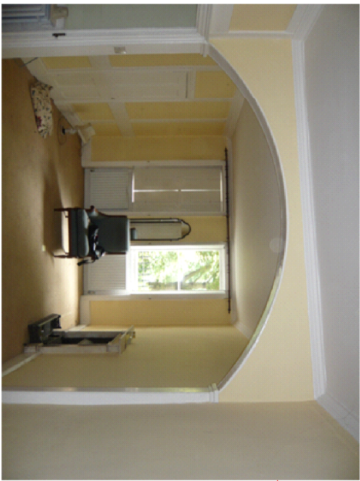
Retain, strip and repair; wooden wall panelling, sash windows and window shutters.