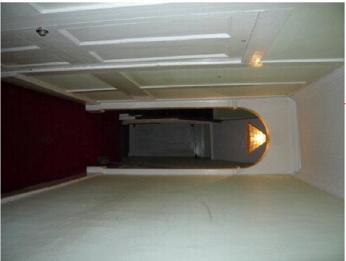
Retain wooden wall panelling and wooden staircase with balustrade.