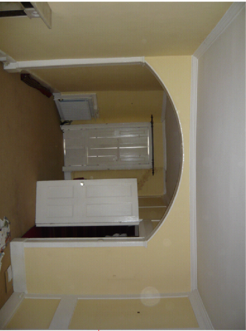
Retain, strip and repair; wooden wall panelling, sash windows and window shutters.