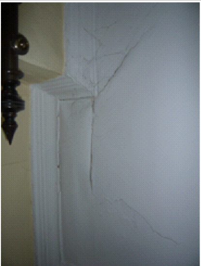
Retain and repair areas of water damaged lath and plaster ceiling and cornice.