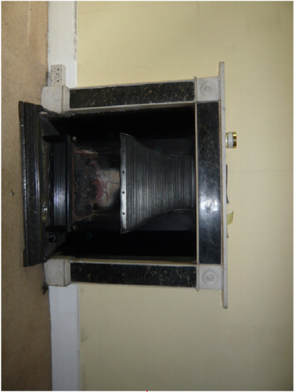
Retain fireplace surround and reinstate hearth.