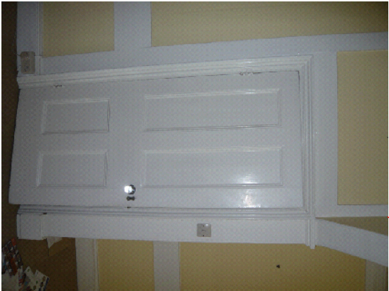
Strip and repaint all timber doors.