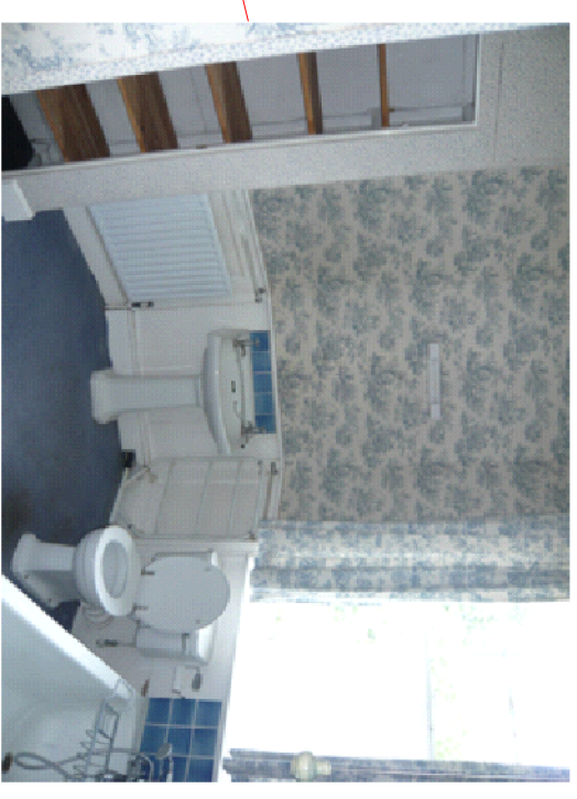
Overhaul and repair sash window. Repair and retain cornice. New bathroom stud wall partition shall have moulded plaster cornice and timber skirting to match the existing.