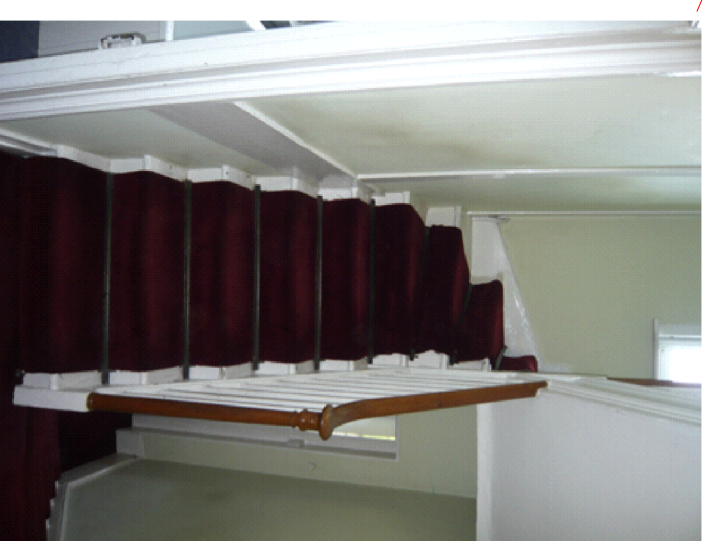
Retain hallway panelling. Retain wooden staircase and balustrade.