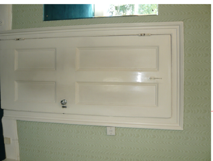
Strip and repaint timber door. Retain skirting and architrave. Remove cupb. door and retain door opening with architrave.