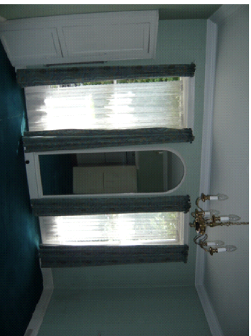
Overhaul and repair sash windows. Retain skirting and floorboards.