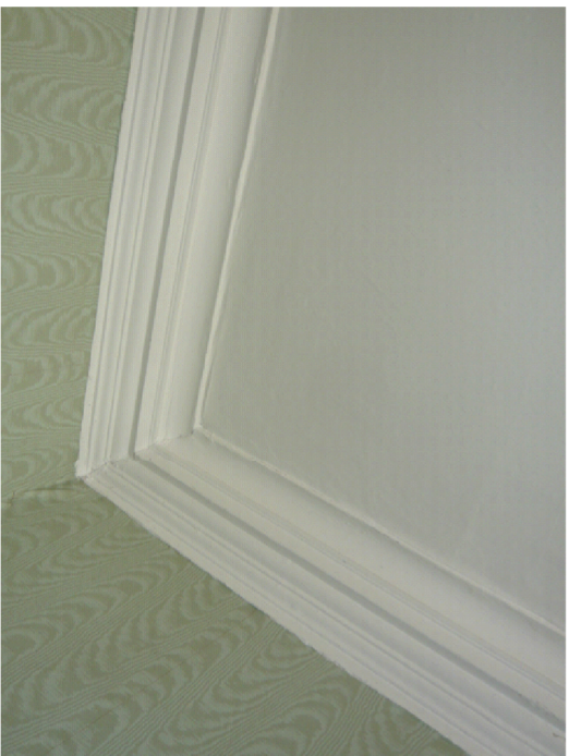
Existing ceiling and cornice to be retained and repaired.