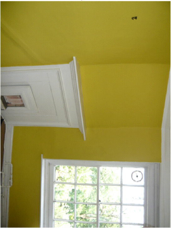
Overhaul and repair sash window. Fireplace to be retained.