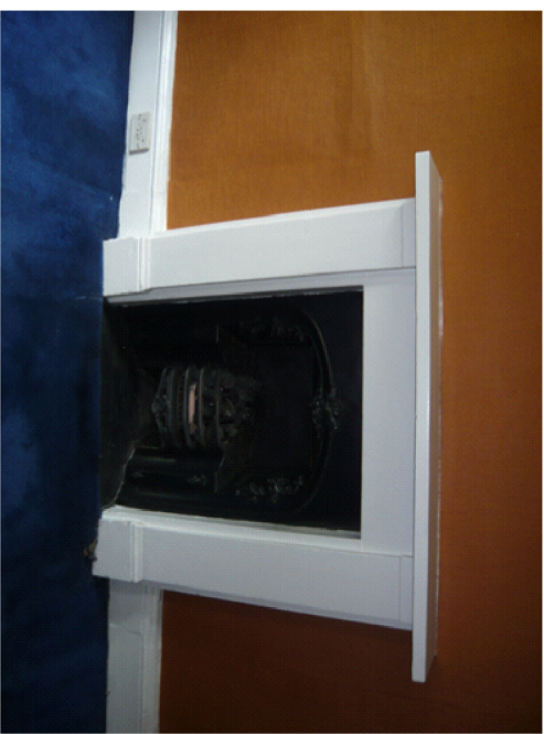
Fireplace to be removed.