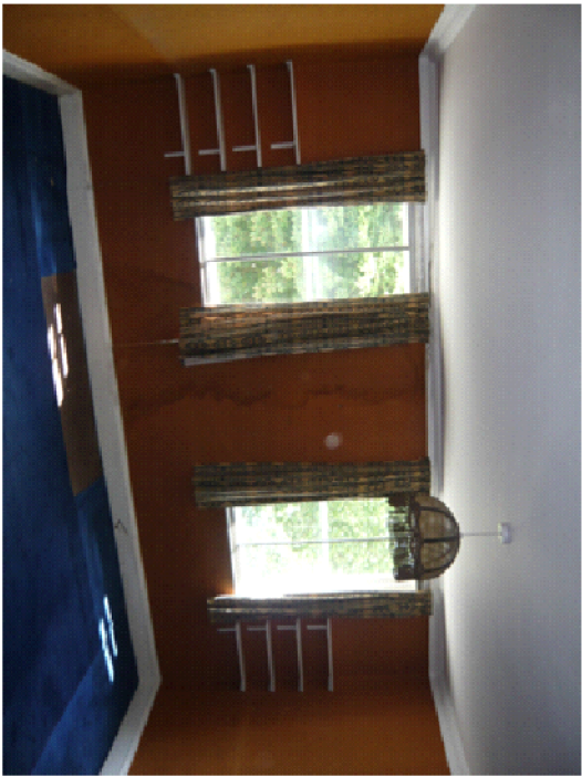
Overhaul and repair sash windows. Retain skirting and floorboards. Existing ceiling and cornice to be retained and repaired from water damage. At new bedroom wall partition, mould new plaster cornice to match existing.