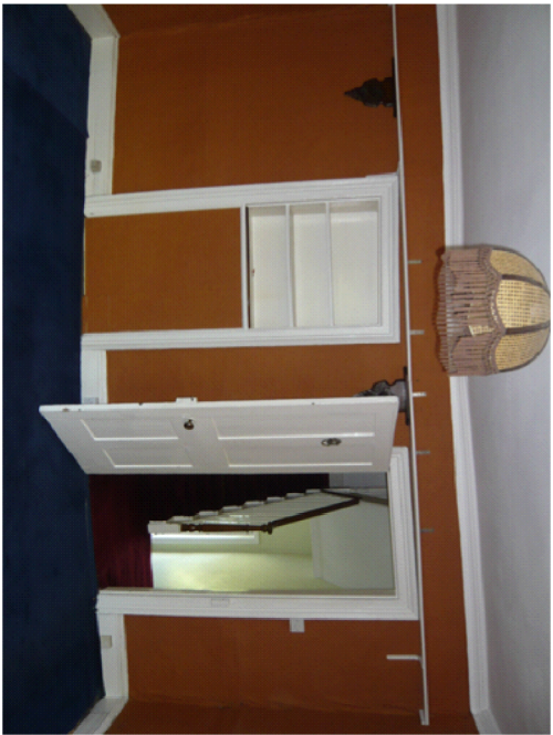
Existing bedroom door to be removed and re-hung on new wall partition and bedroom entrance. The adjacent alcove/shelving with architrave shelving is to be removed and blocked up.