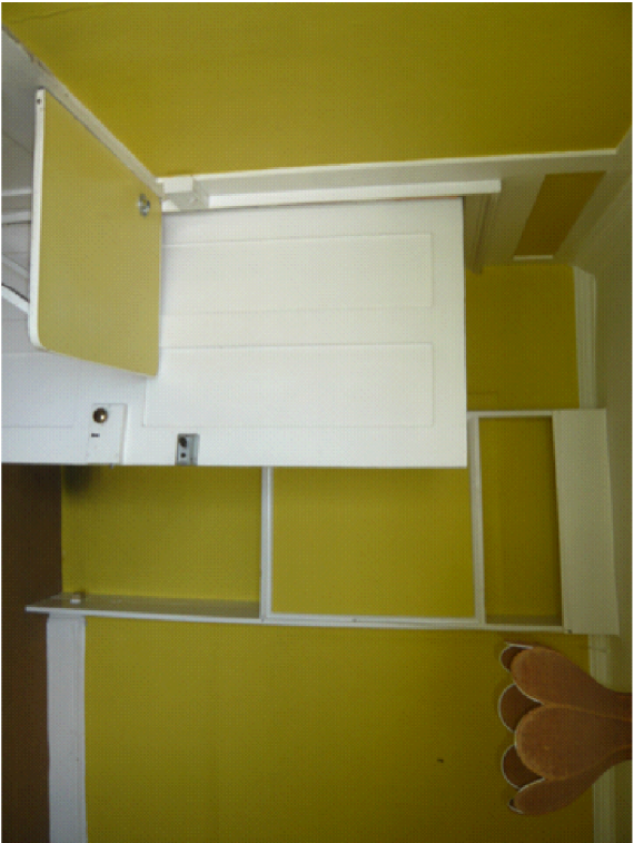
Strip and repaint timber door. Retain skirting and architrave. Retain and repair cornice.