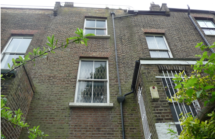
3. Rear elevation