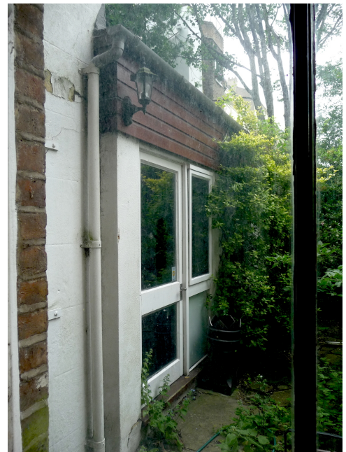
4. Elevation of existing rear extension