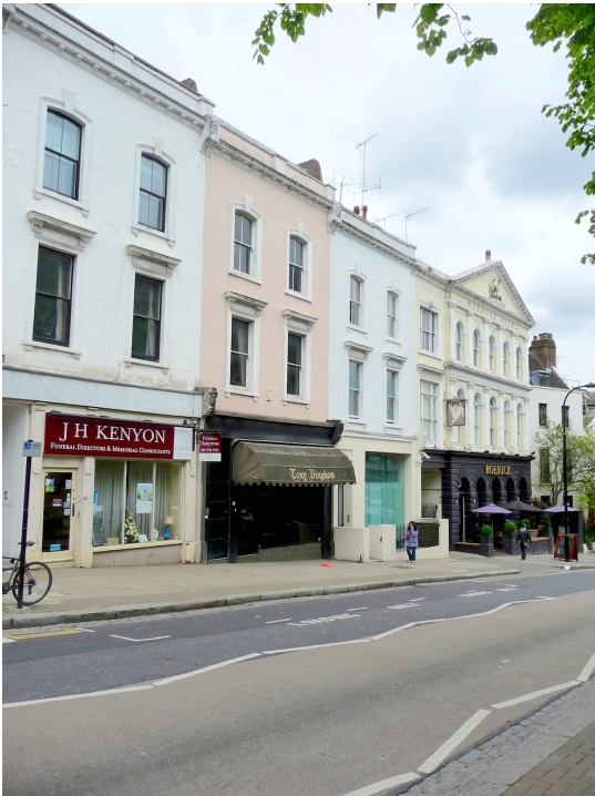
1. Frontage to Pond Street