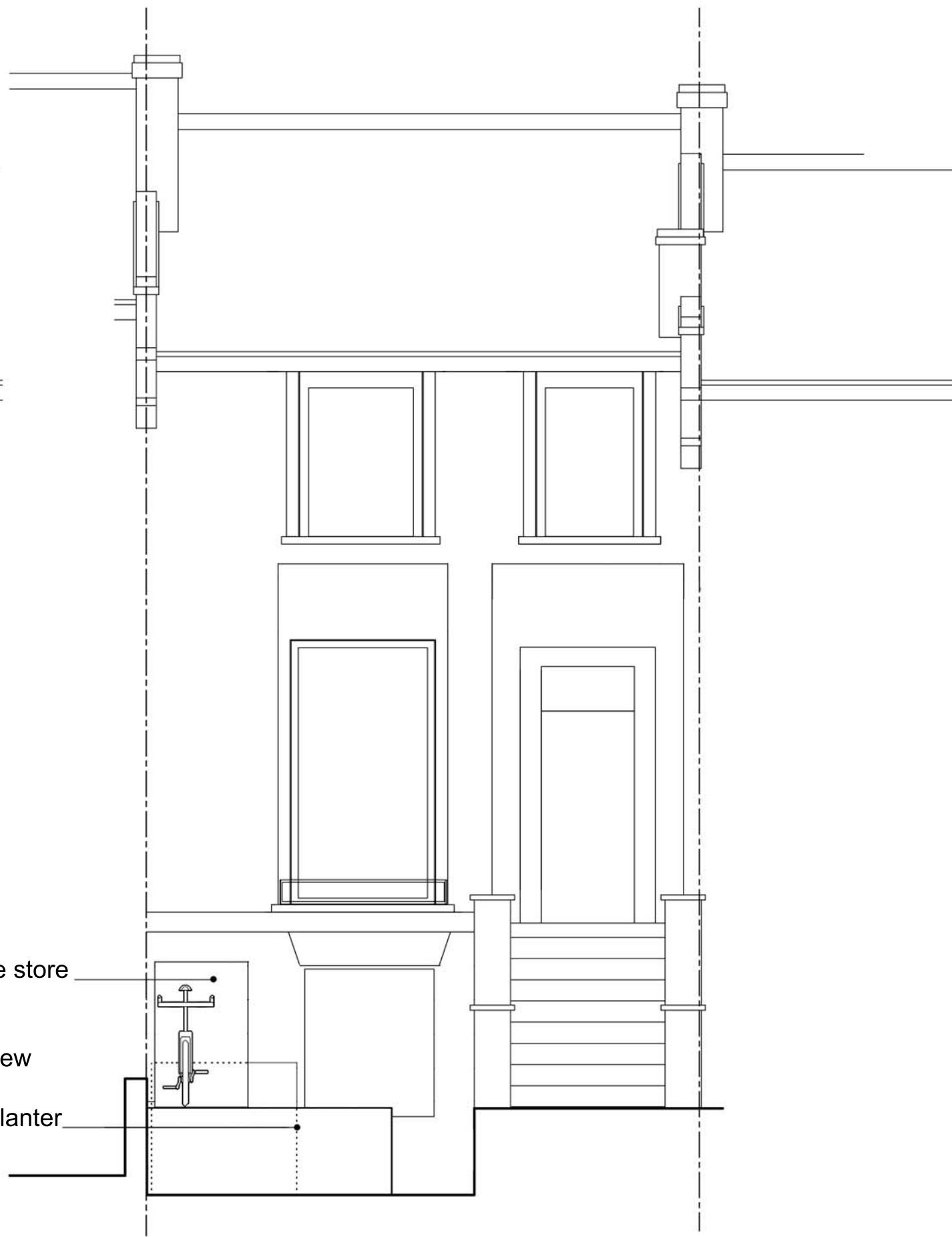
Proposed Building Front Elevation 1:50 Scale