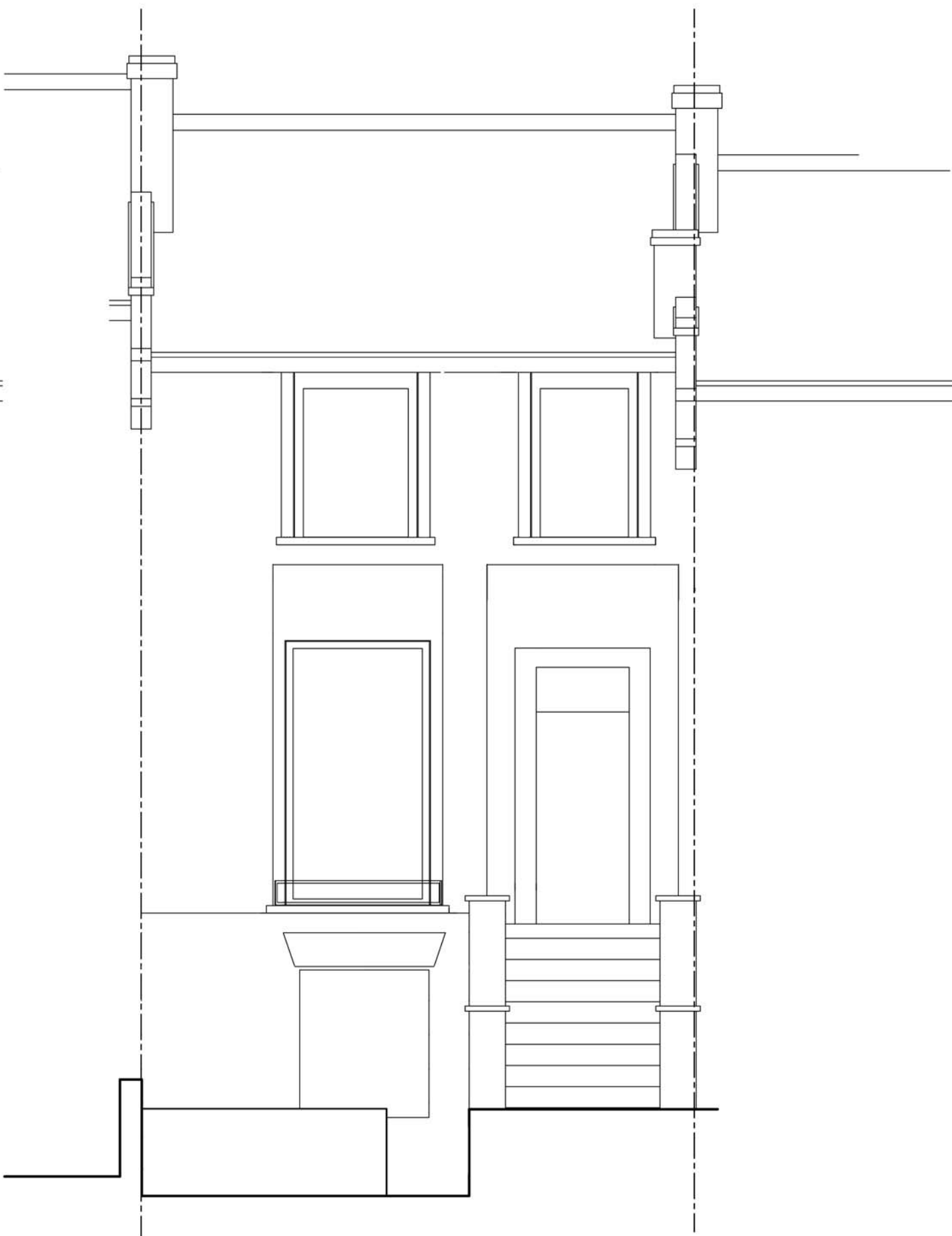
Existing Building Front Elevation 1:50 Scale