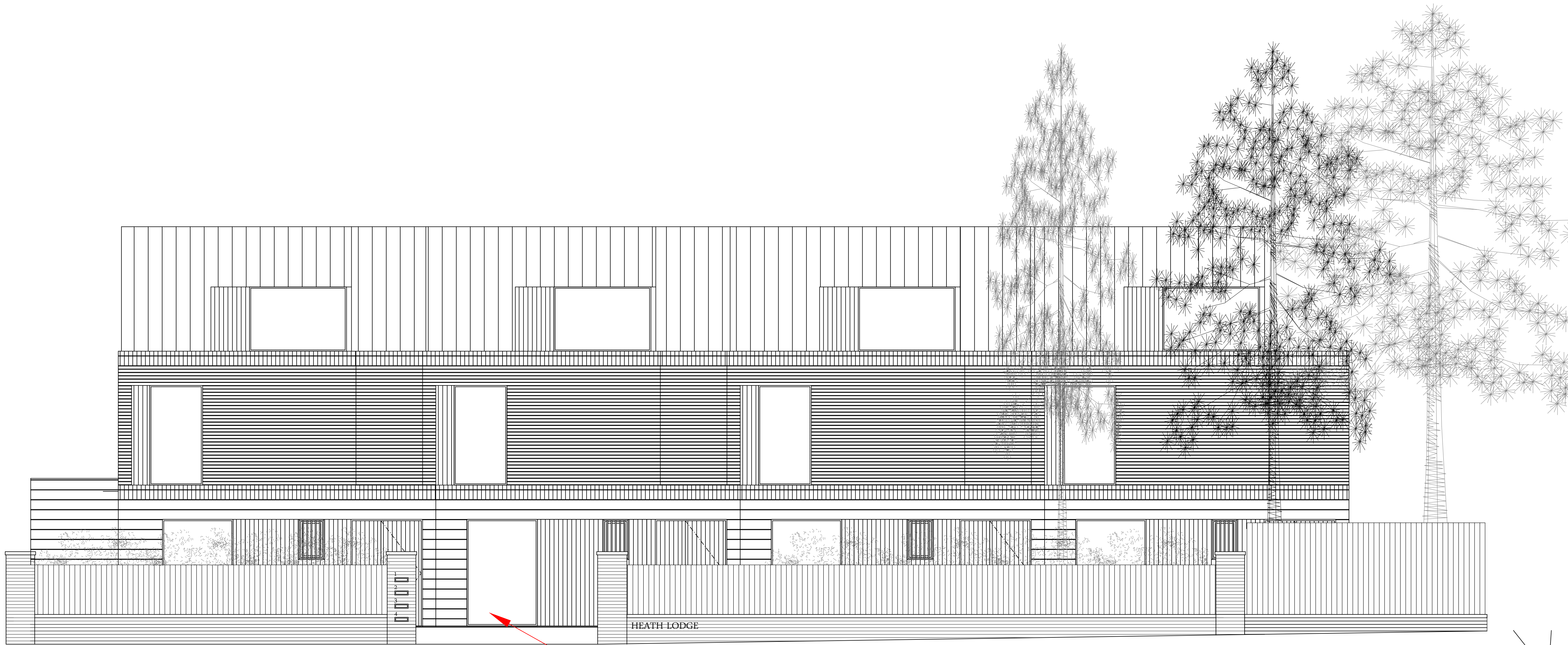
PROPOSED LOCATION OF NEW SLIDING GATE AS EXISTING ELEVATION VIEWED FROM NORTH END ROAD 1:50 @ A1 - 1:100@ A3