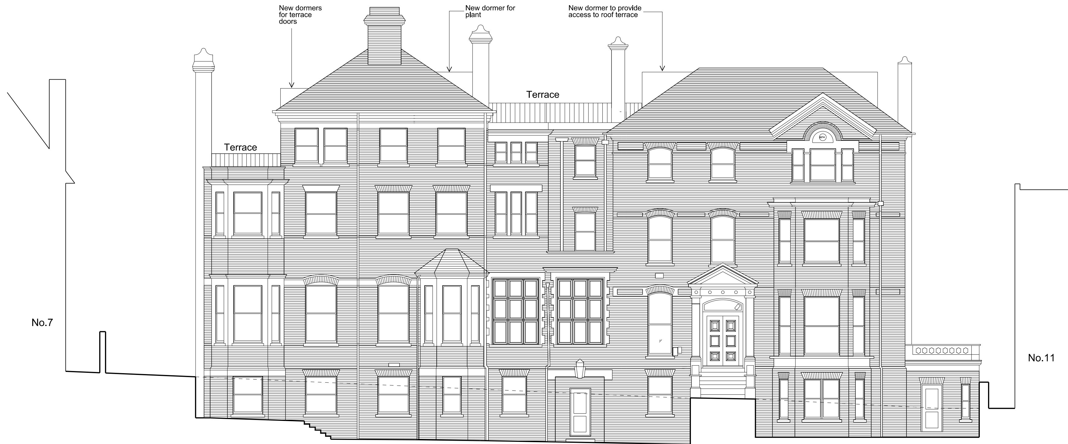
Proposed Front Elevation (Northwest)