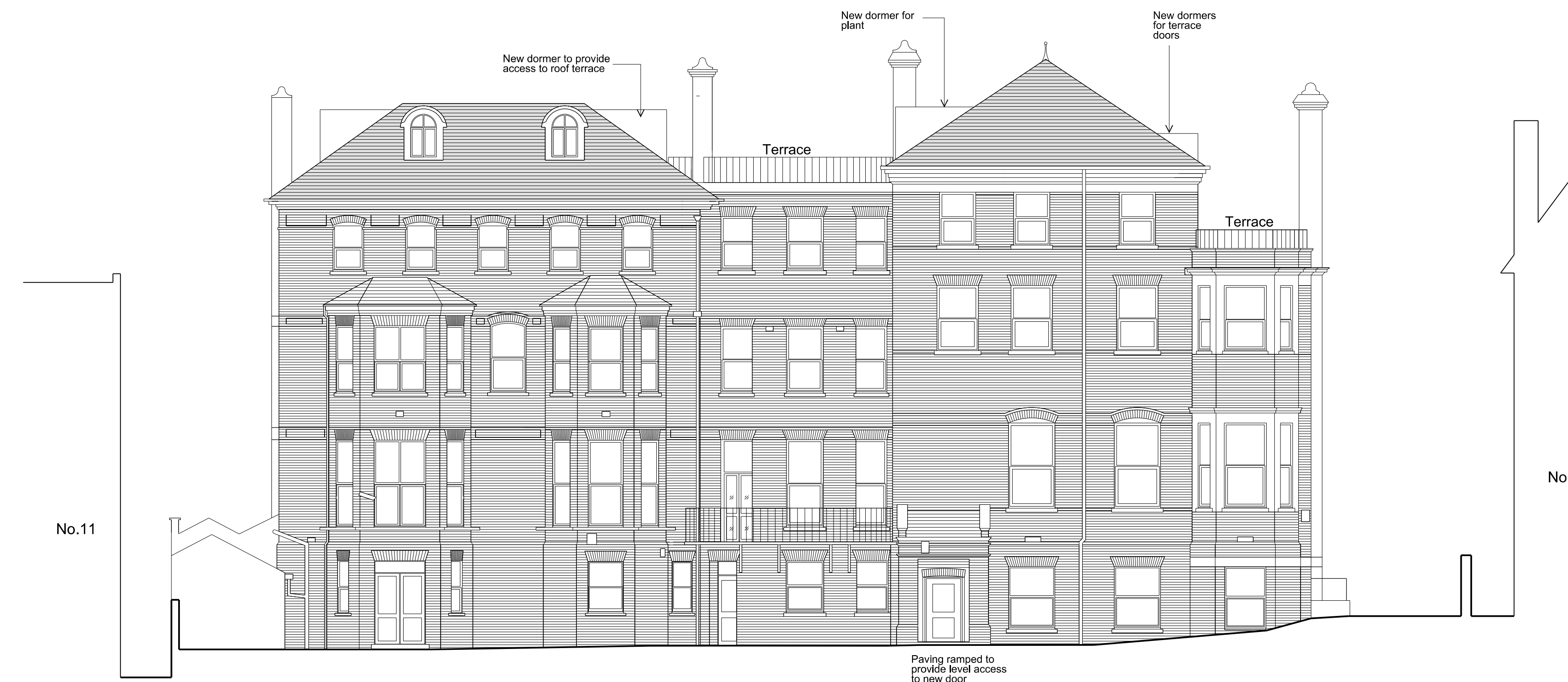
Proposed Rear Elevation (Southeast)