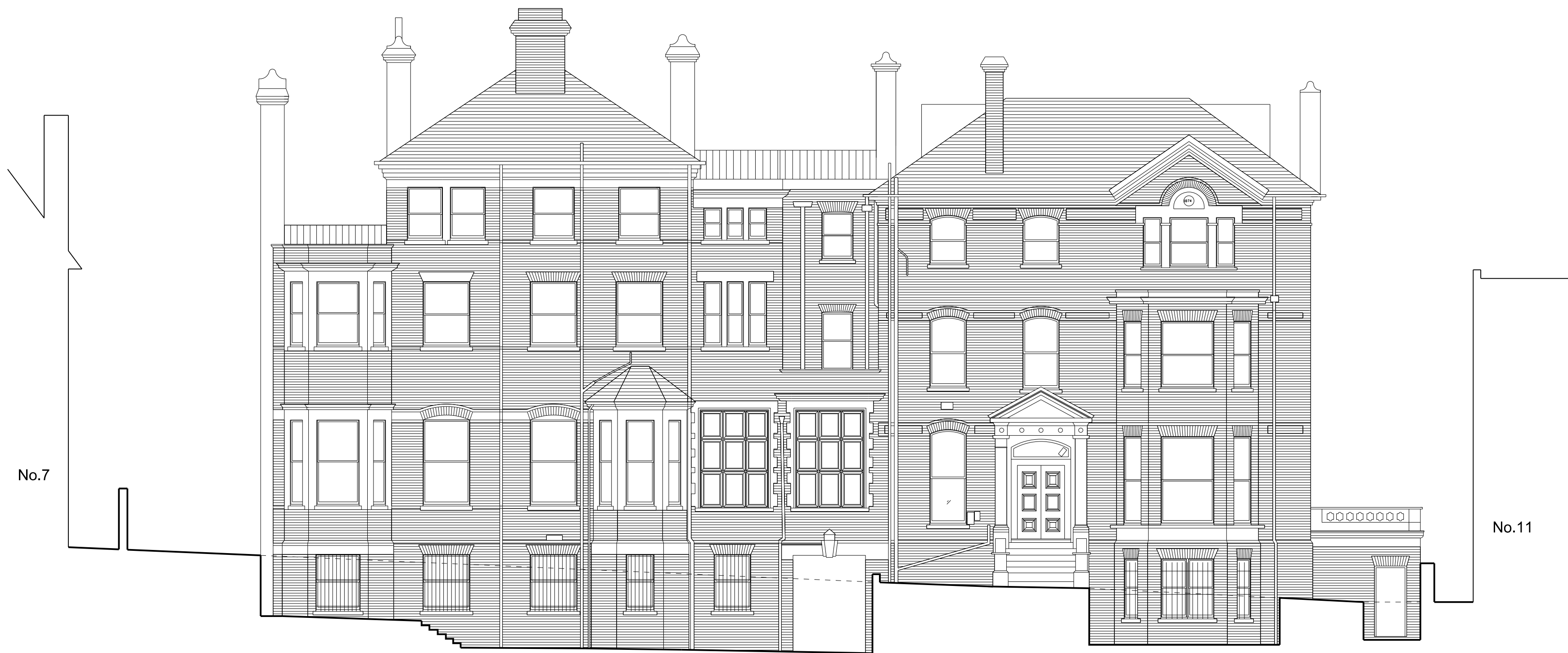
Existing Front Elevation (Northwest)