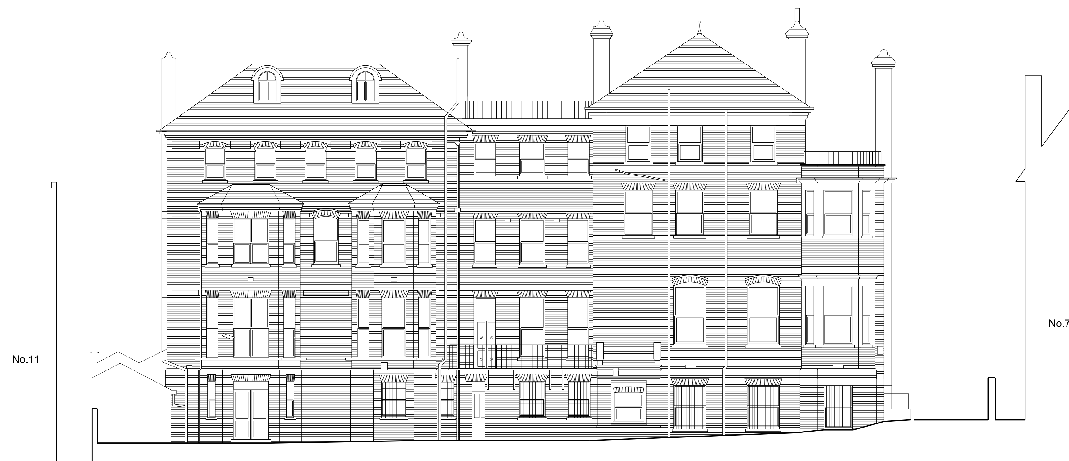
Existing Rear Elevation (Southeast)