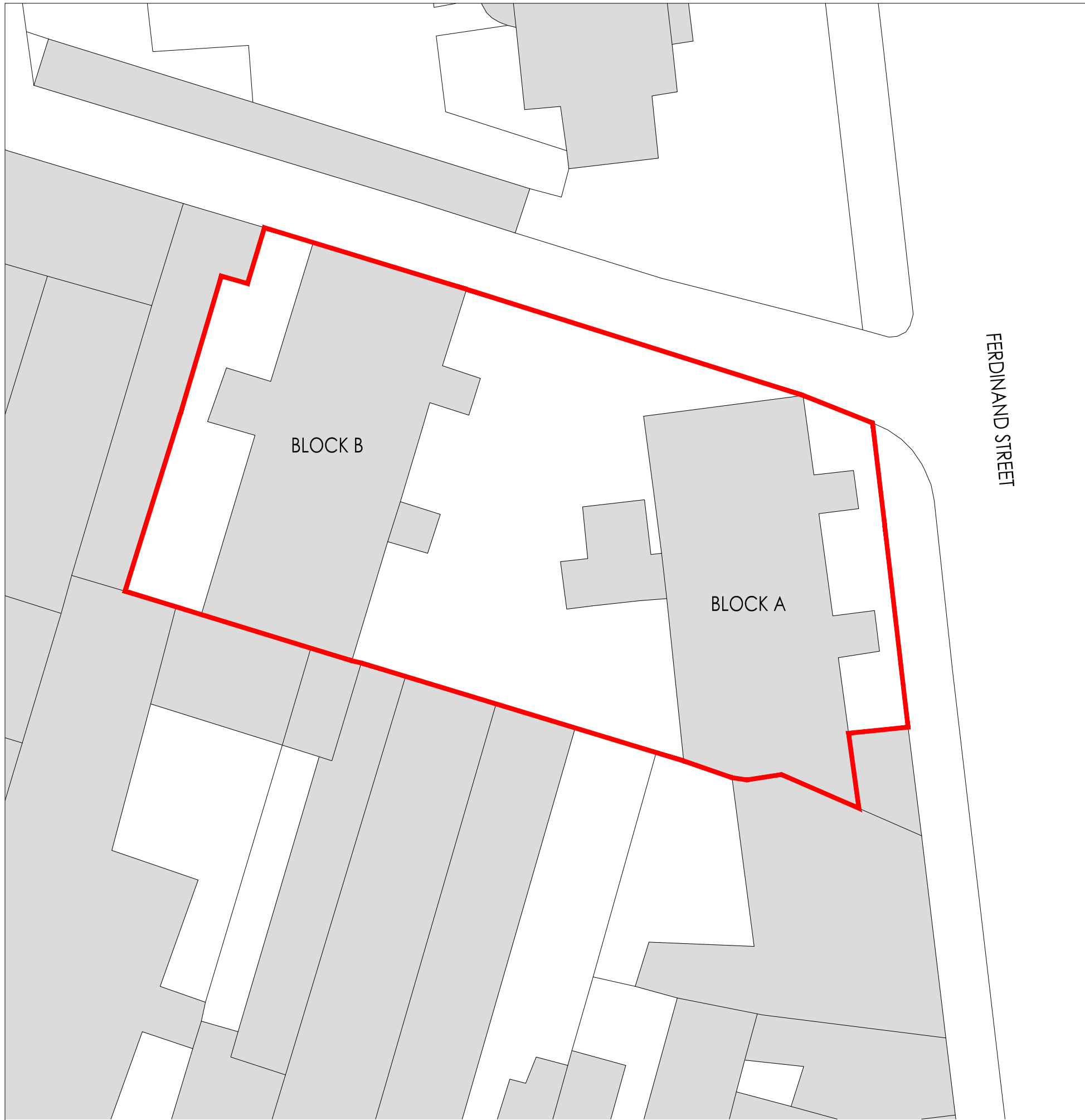
SITE BLOCK PLAN Scale 1:200@A3