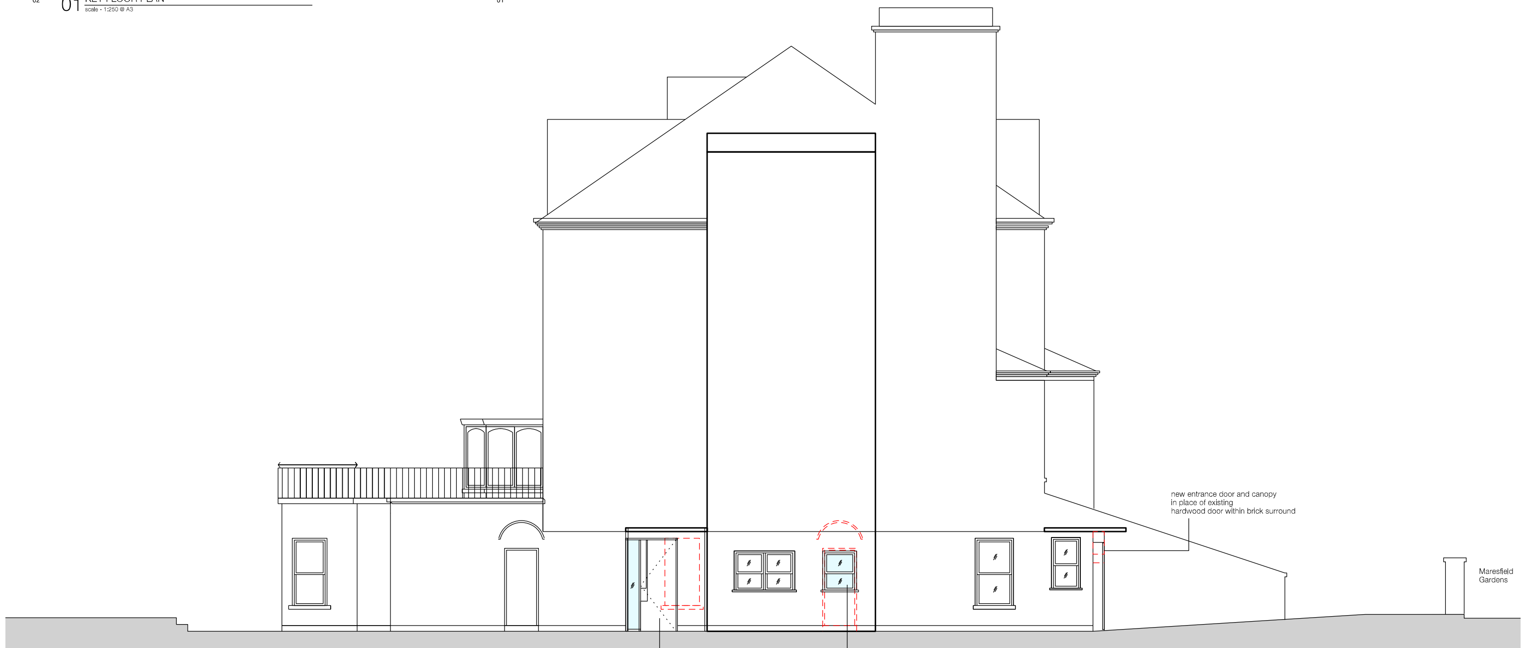
02 PROPOSED SIDE ELEVATION 3 scale - 1:100 @ A3