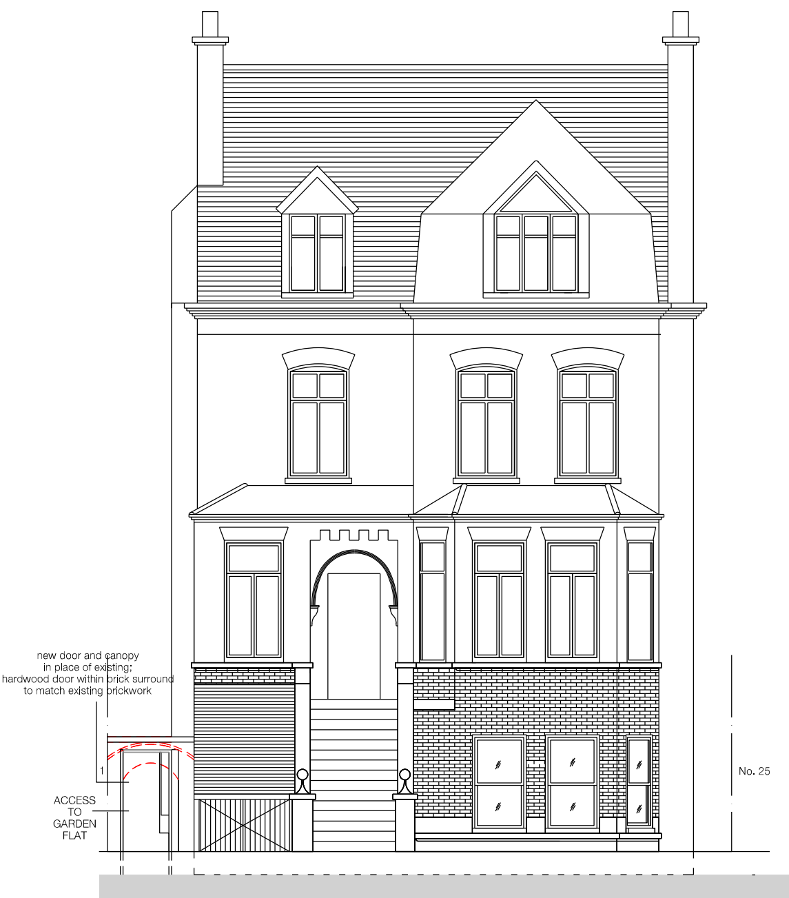
02 PROPOSED FRONT ELEVATION 1 scale - 1:100 @ A3