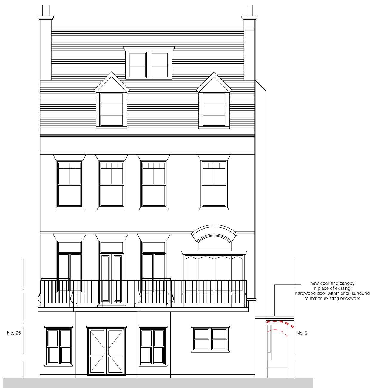
03 PROPOSED REAR ELEVATION 2 scale - 1:100 @ A3