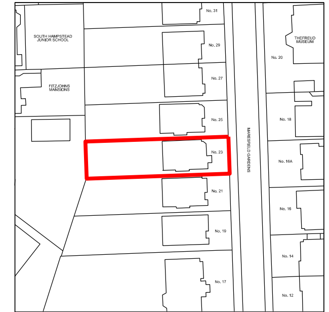
02 SITE PLAN 1:1250 scale - 1:1250 @ A3