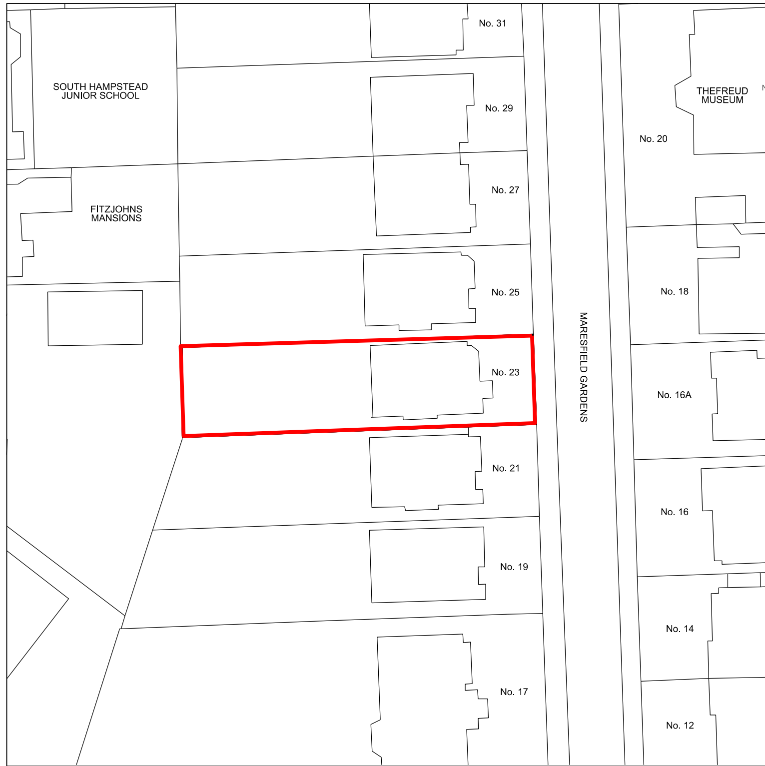
01 SITE PLAN 1:500 scale - 1:500 @ A3