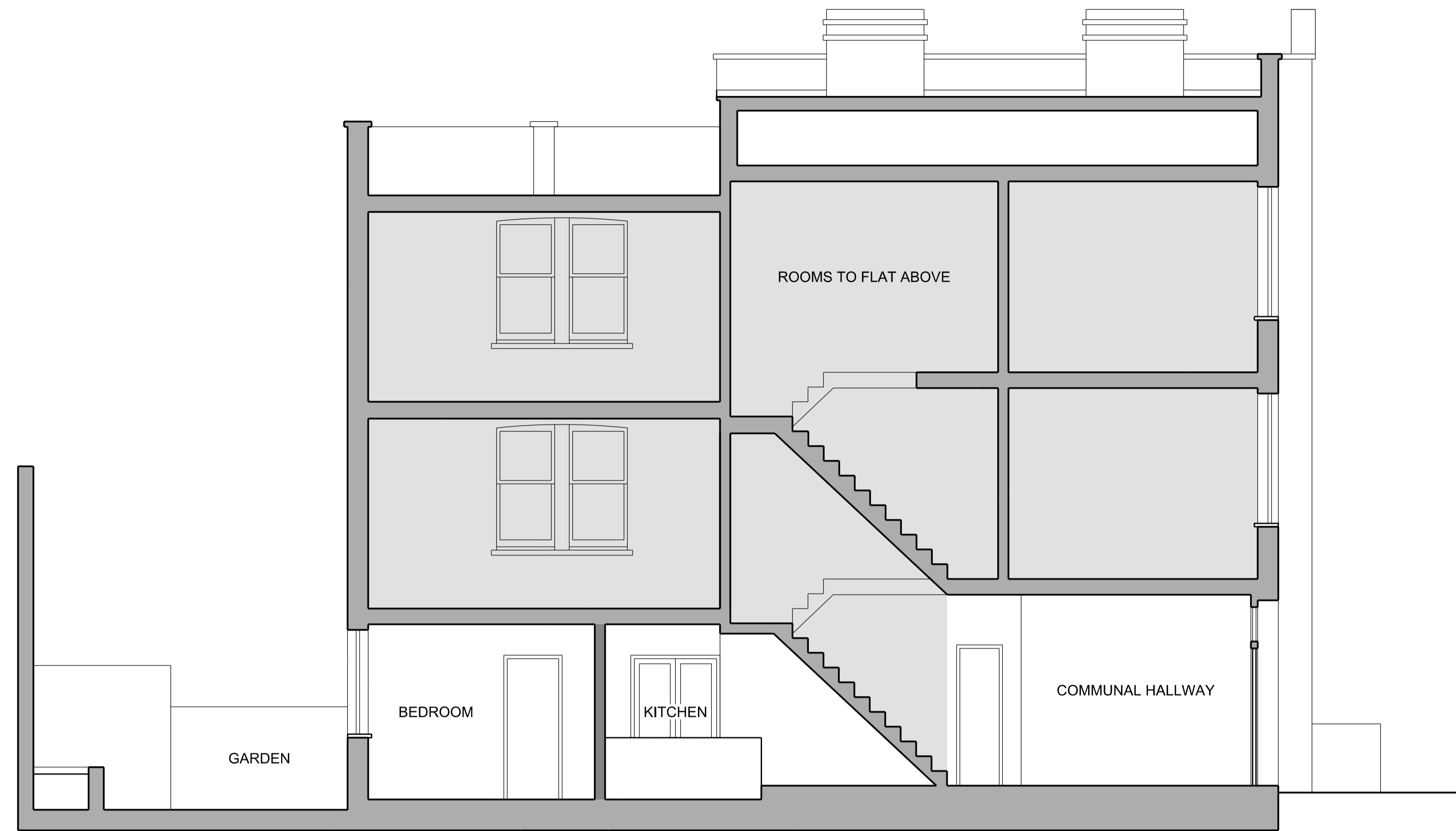
02 SECTION AA