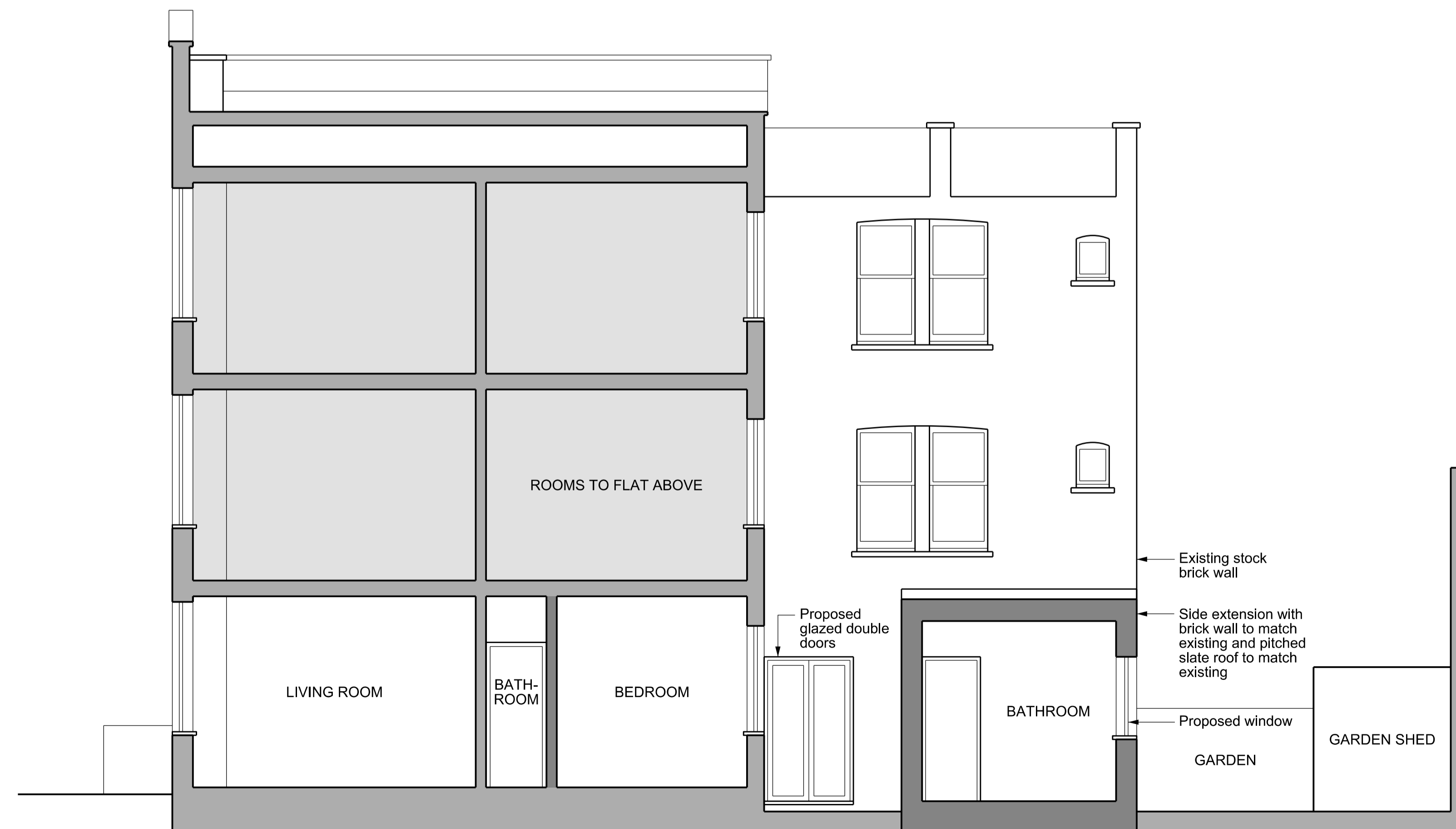
04 SECTION BB