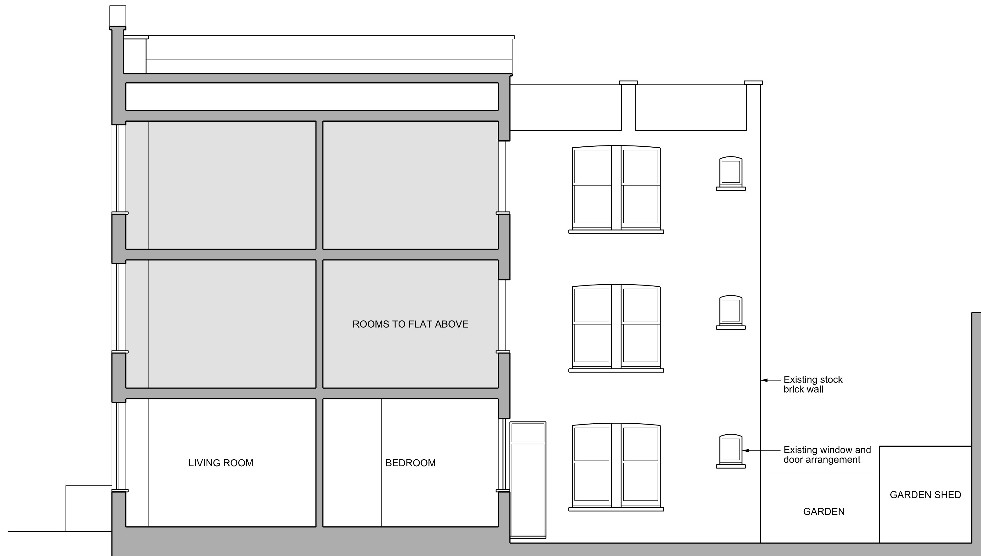
04 SECTION BB