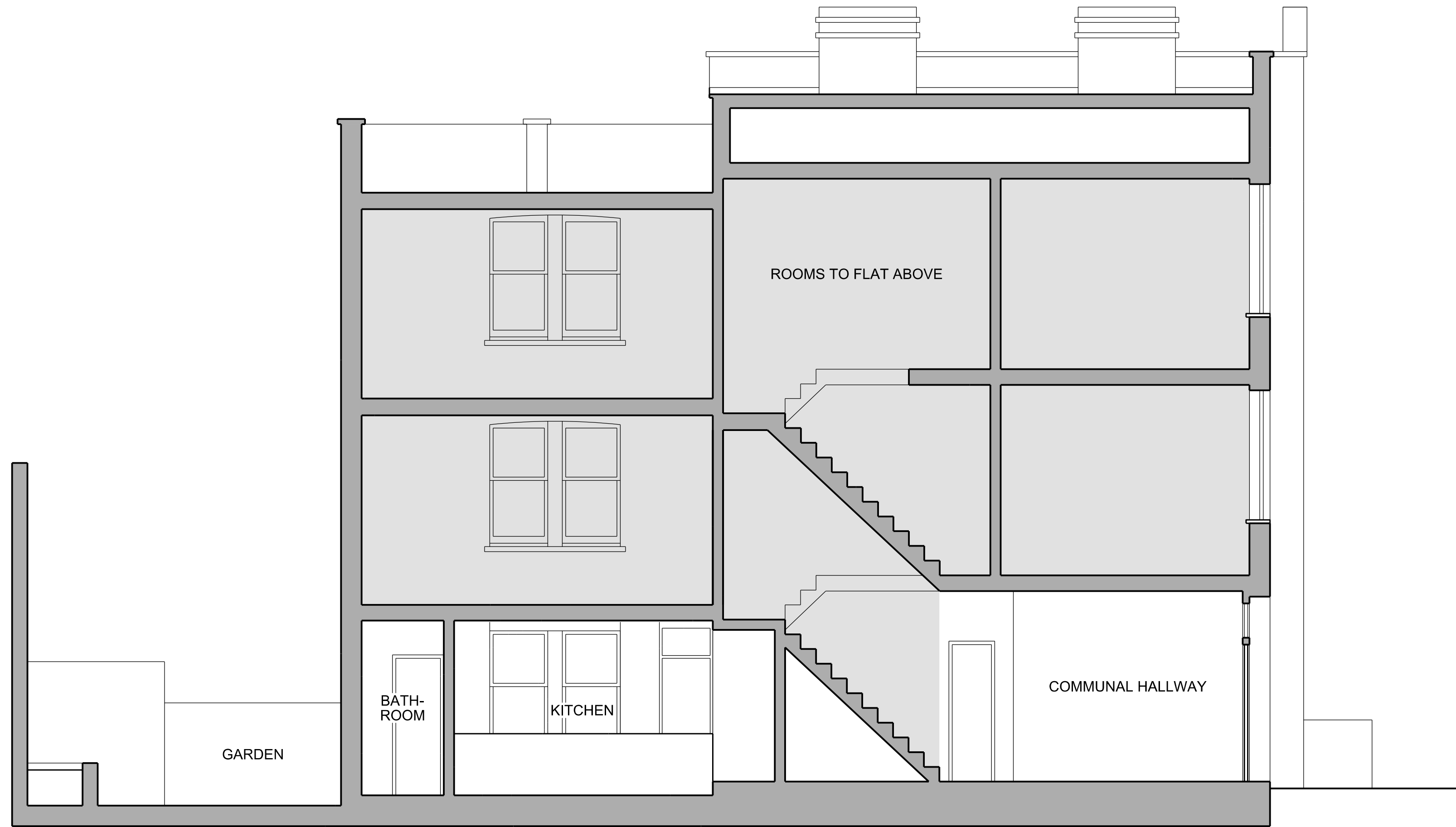
02 SECTION AA