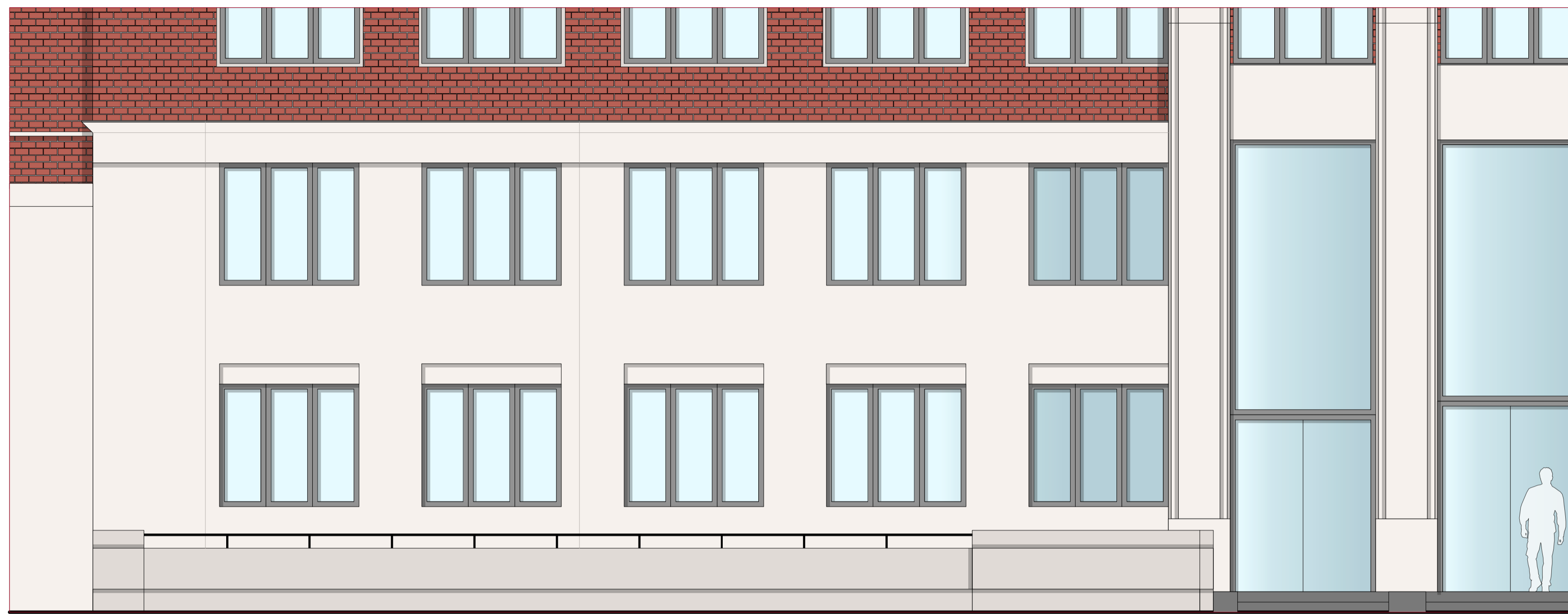
Existing Shopfront 1:50 @ A1