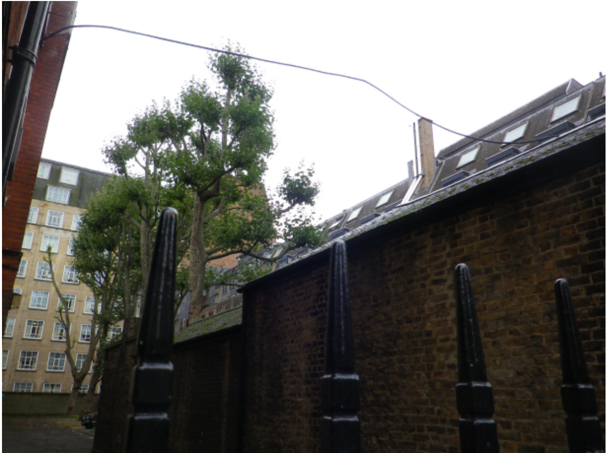
Rear of 2-16 Tavistock Place seen from ambulance entrance in Herbrand Street.