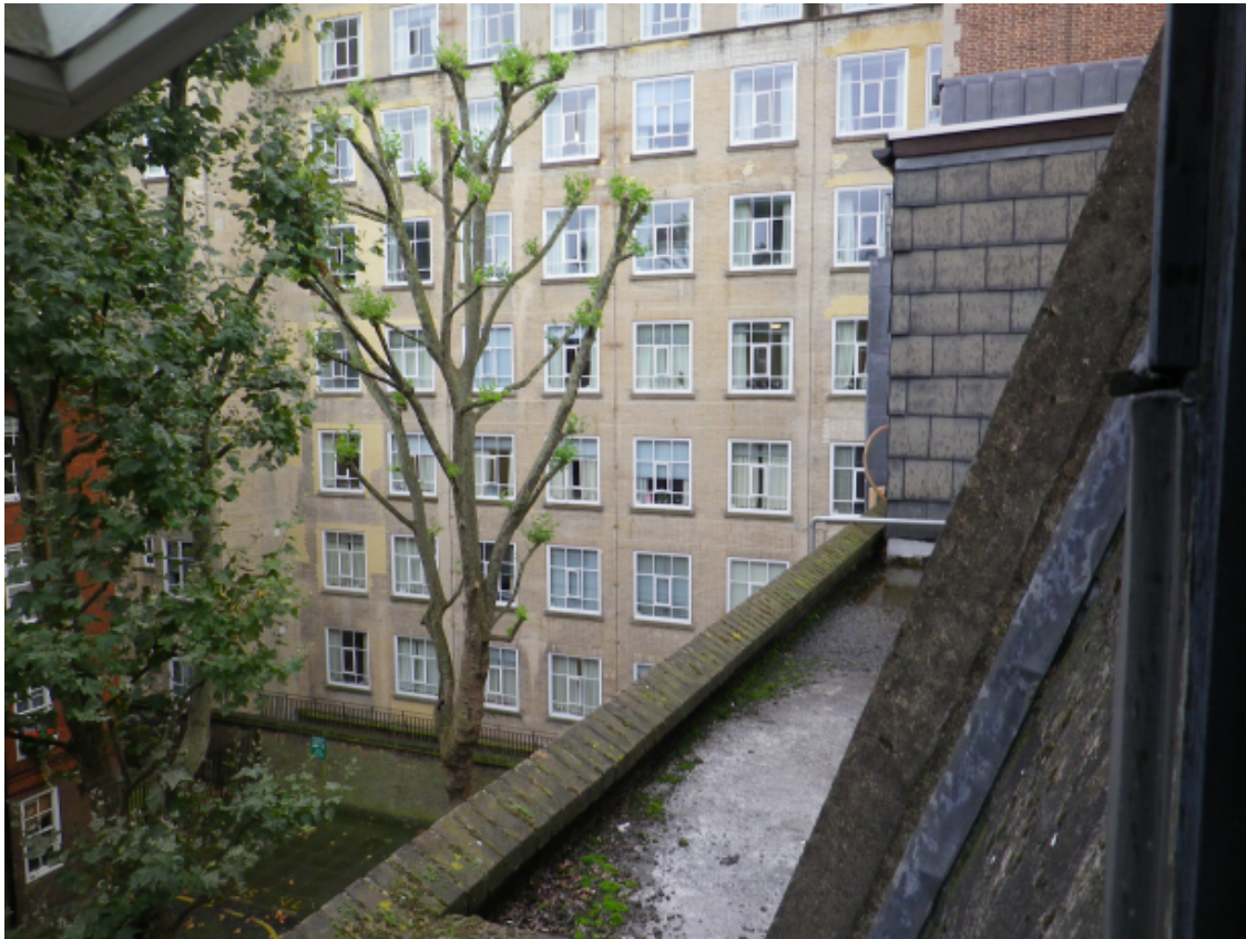
View from rear window of flat 23 looking west. Existing extension to the right.