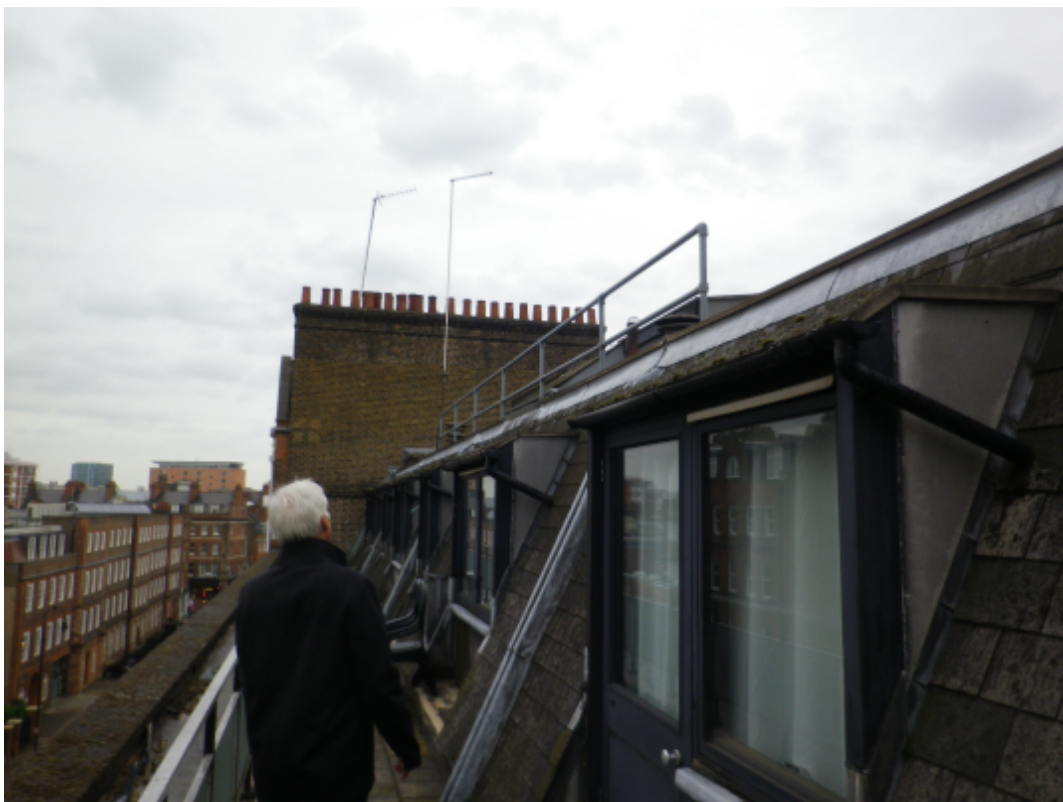
Front balcony, looking east.