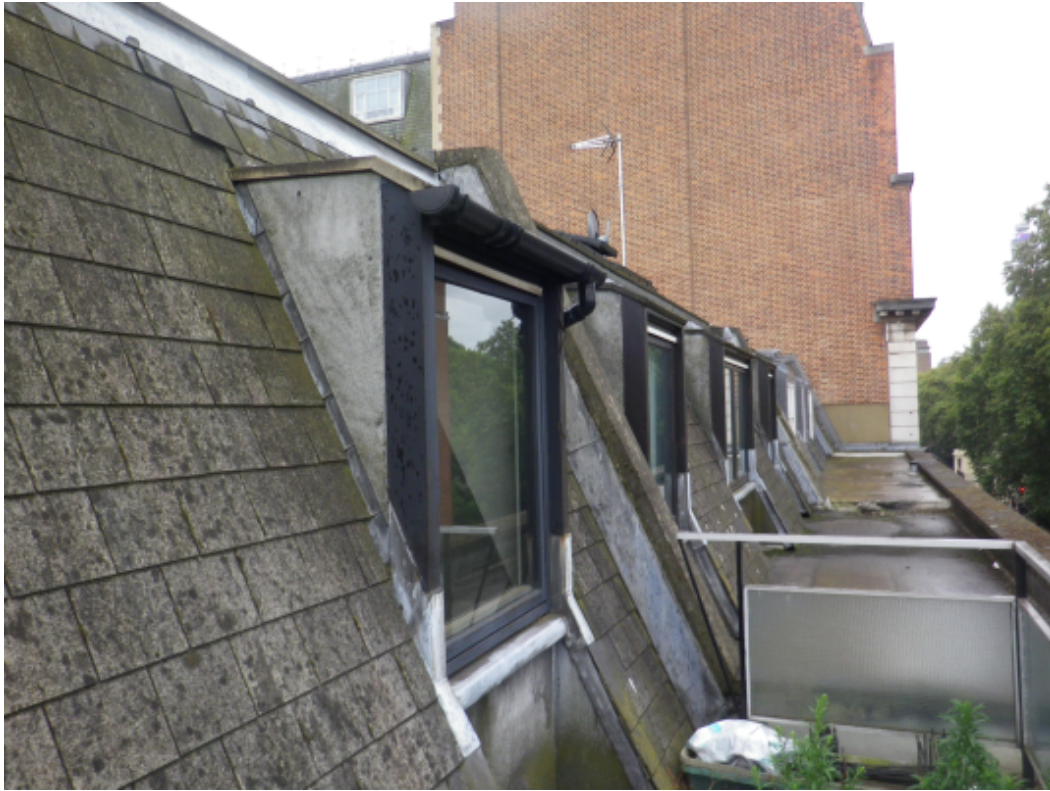
Front balcony, looking west.