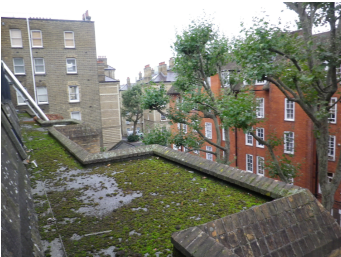
View from rear window of flat 23 looking west.