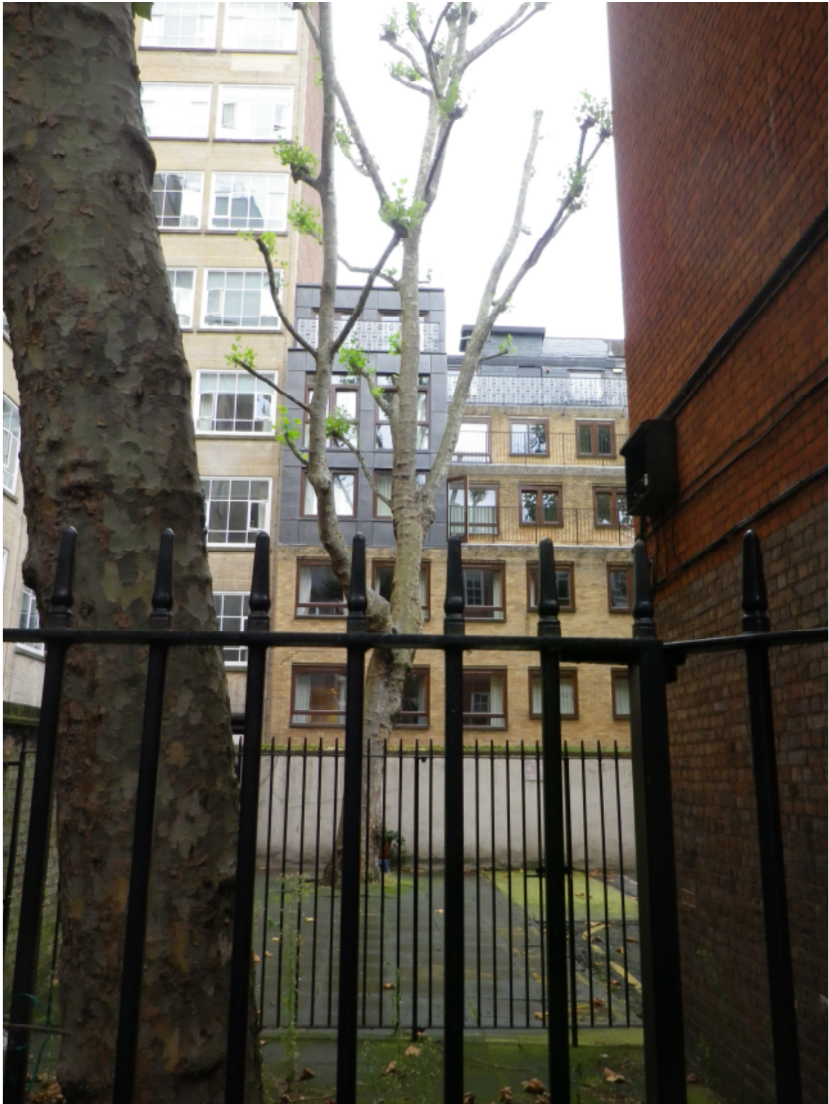
Rear elevation at no. 2 Tavistock Place, showing extensions approved in 2010.