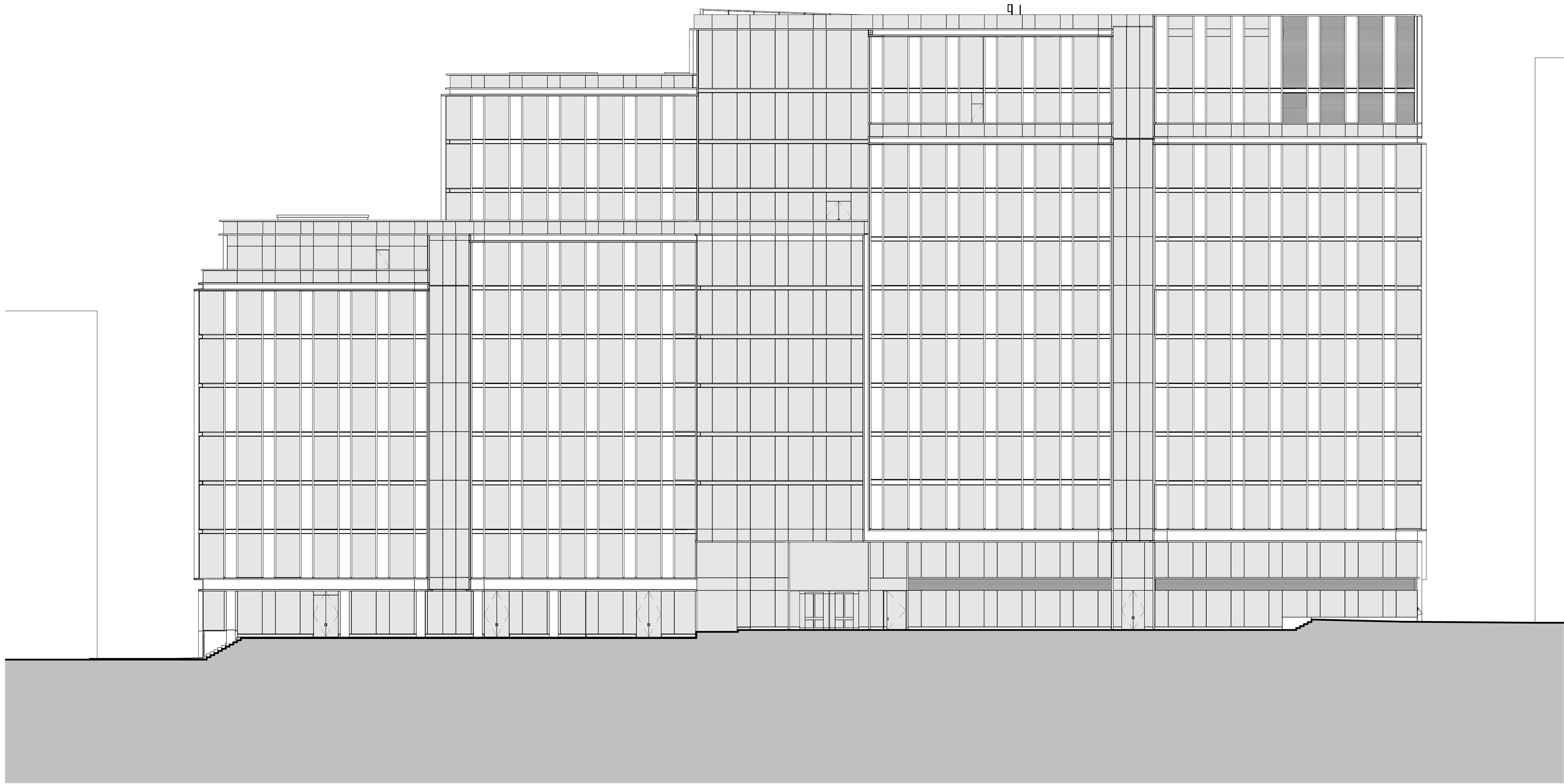
1 Existing East Elevation, 1 : 200@A1