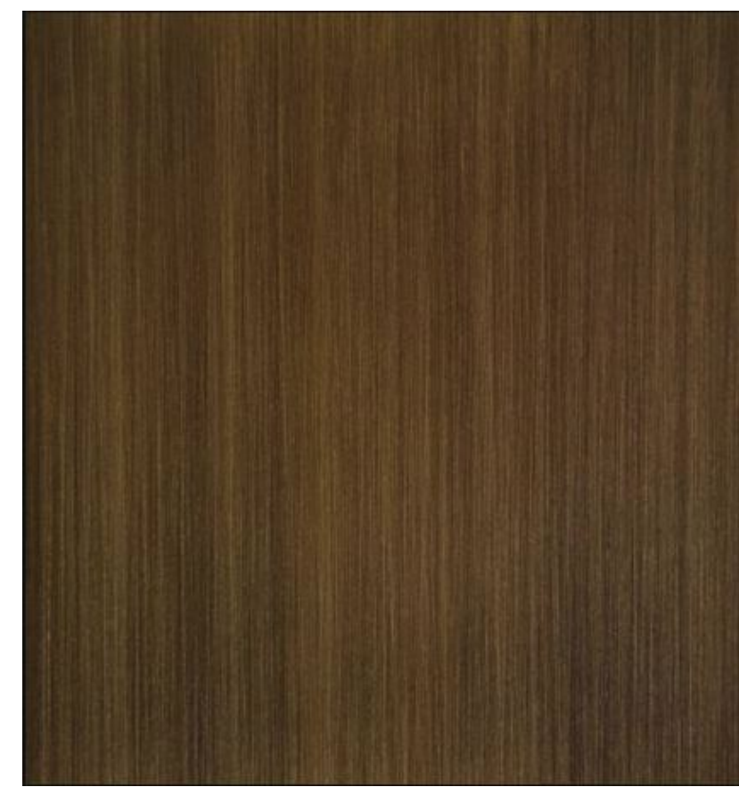
3 DARK BRONZE FINISH (REF BMA)