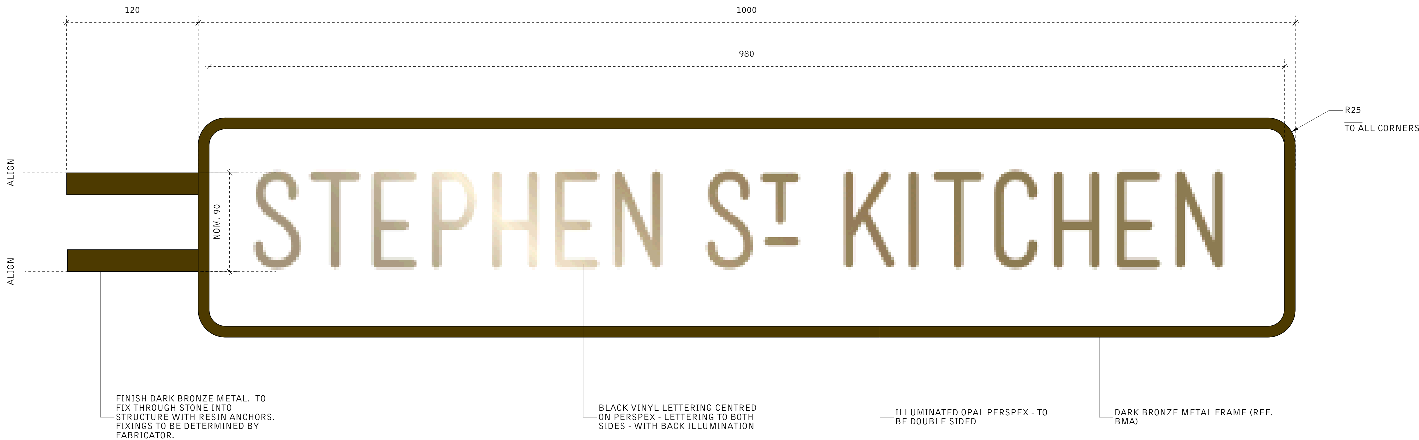
1 DETAIL ELEVATION - PROPOSED BLADE SIGN Scale: Half Actual Size