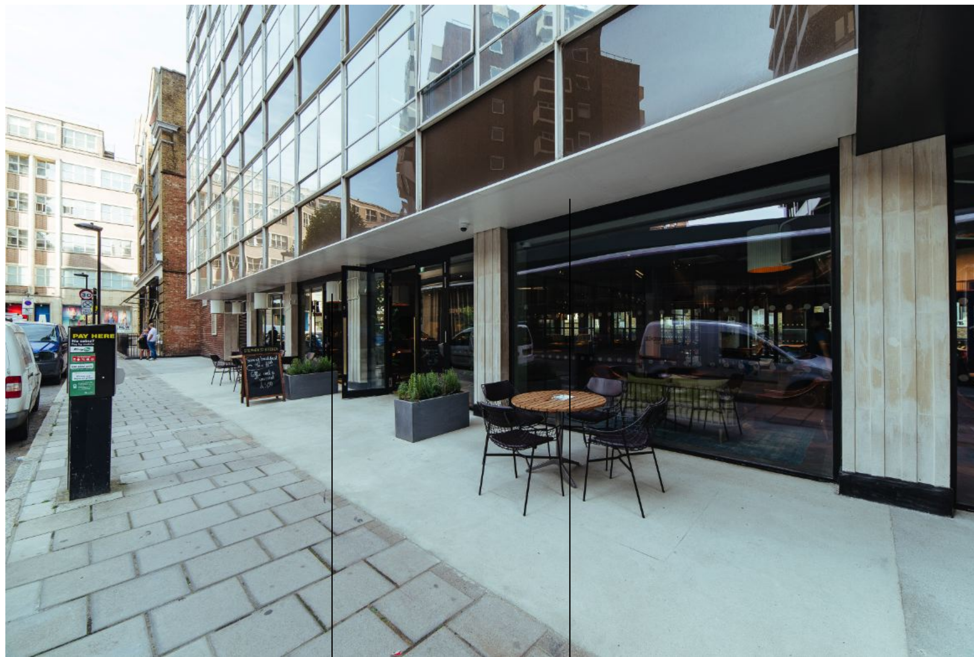
3 EXISTING FACADE