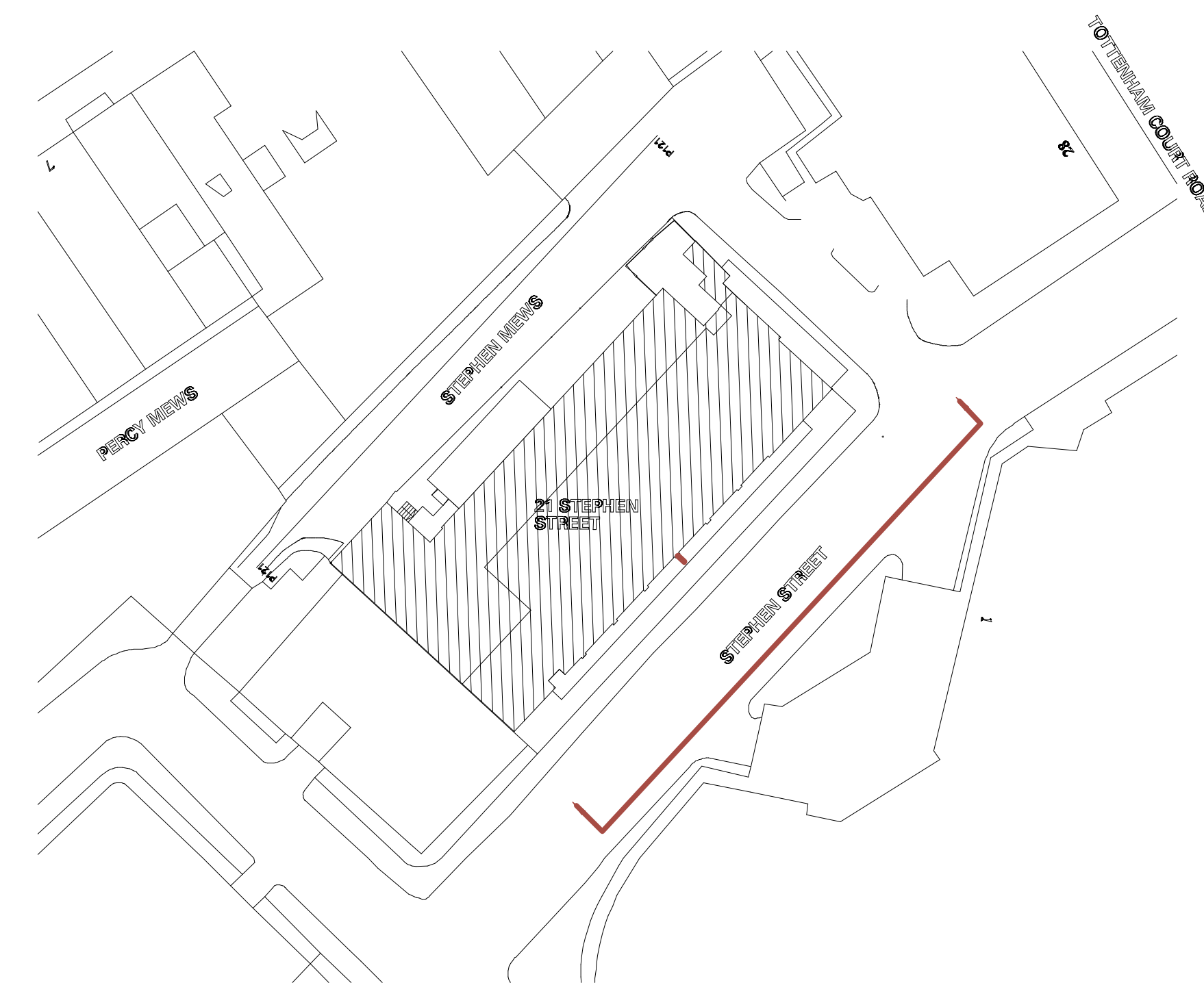
2 SITE PLAN Scale: 1:500