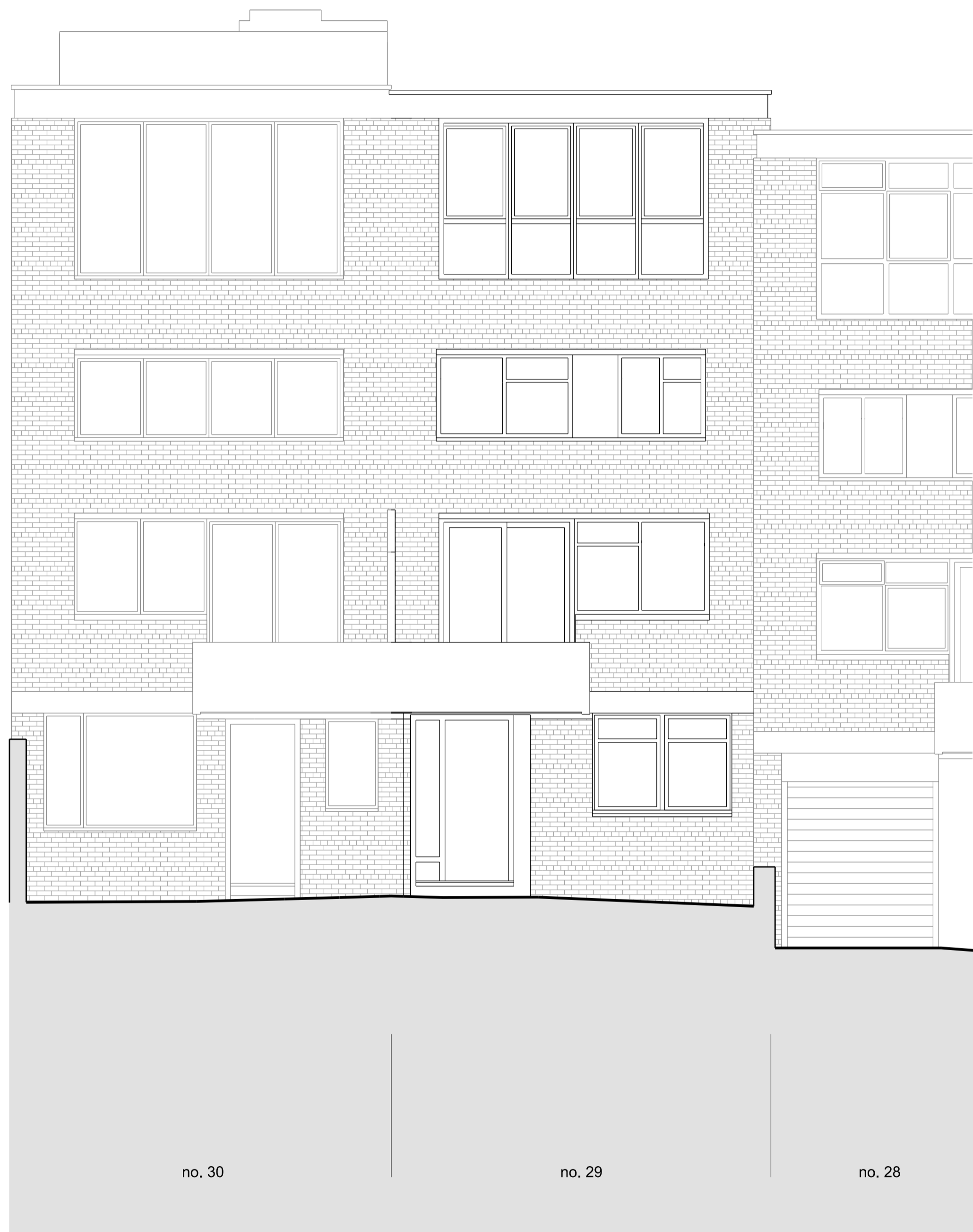
01 Existing Front Elevation Scale 1:50 @A1 / 1:100 @A3