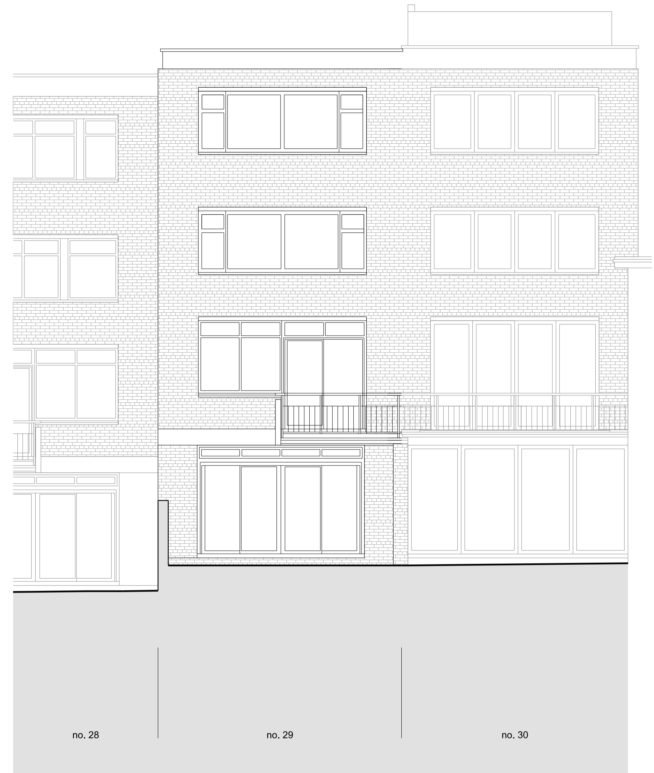
02 Existing Rear Elevation Scale 1:50 @A1 / 1:100 @A3