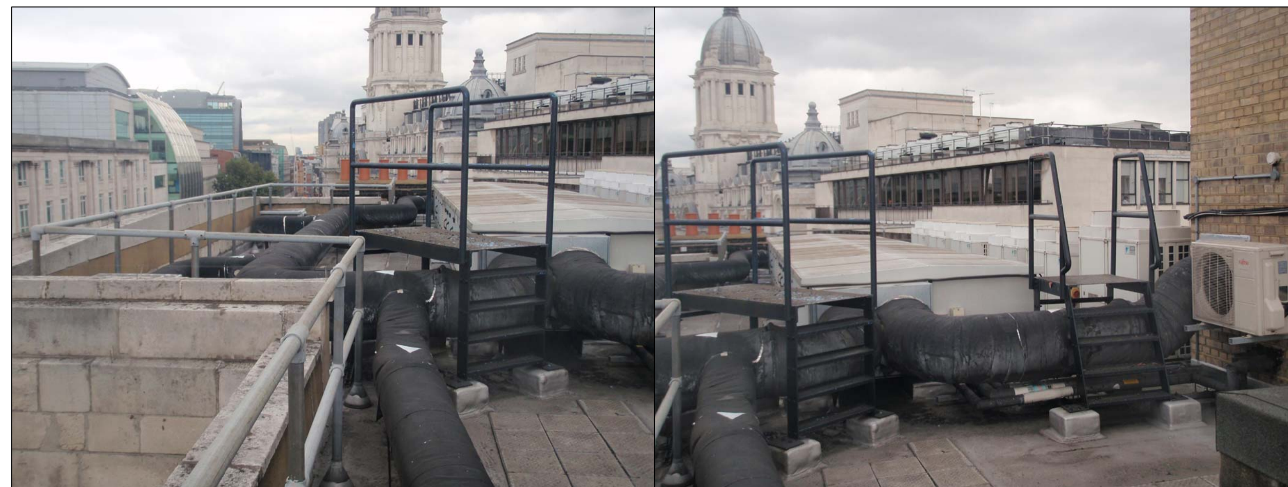
EXISTING VIEW ACROSS ROOFTOP (LOOKING EAST)