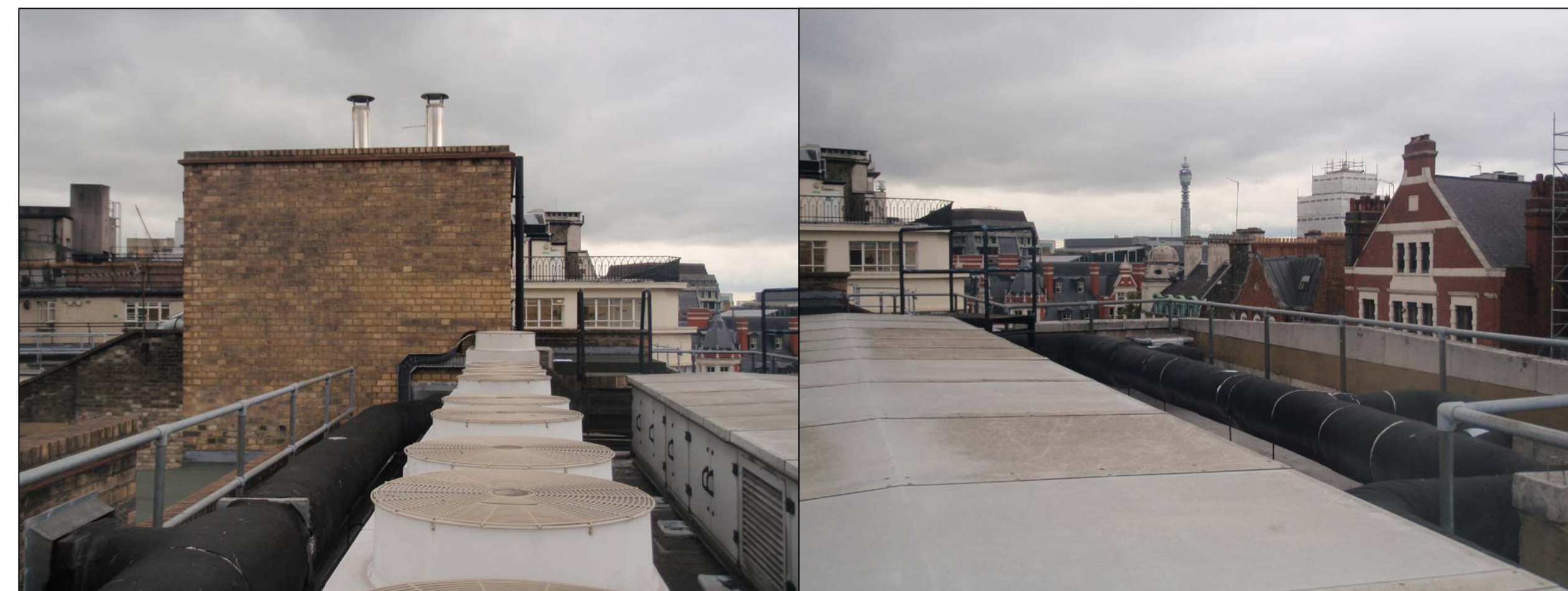
EXISTING VIEW ACROSS ROOFTOP (LOOKING WEST)