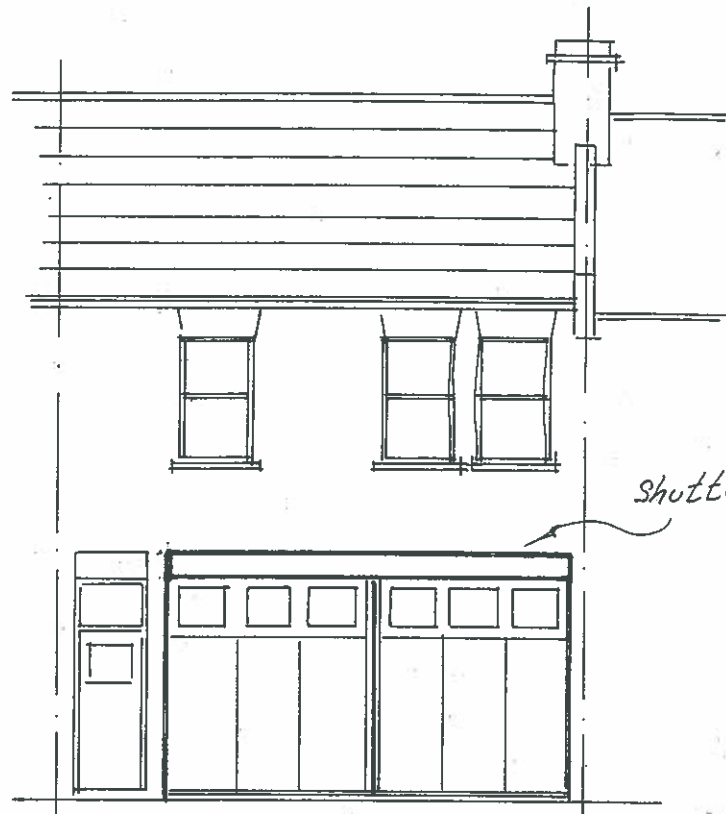
Proposed (shutter in open position)