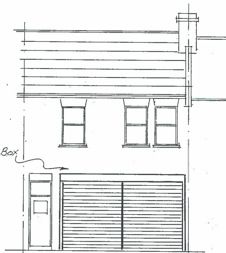
Proposed (shutter in closed position)