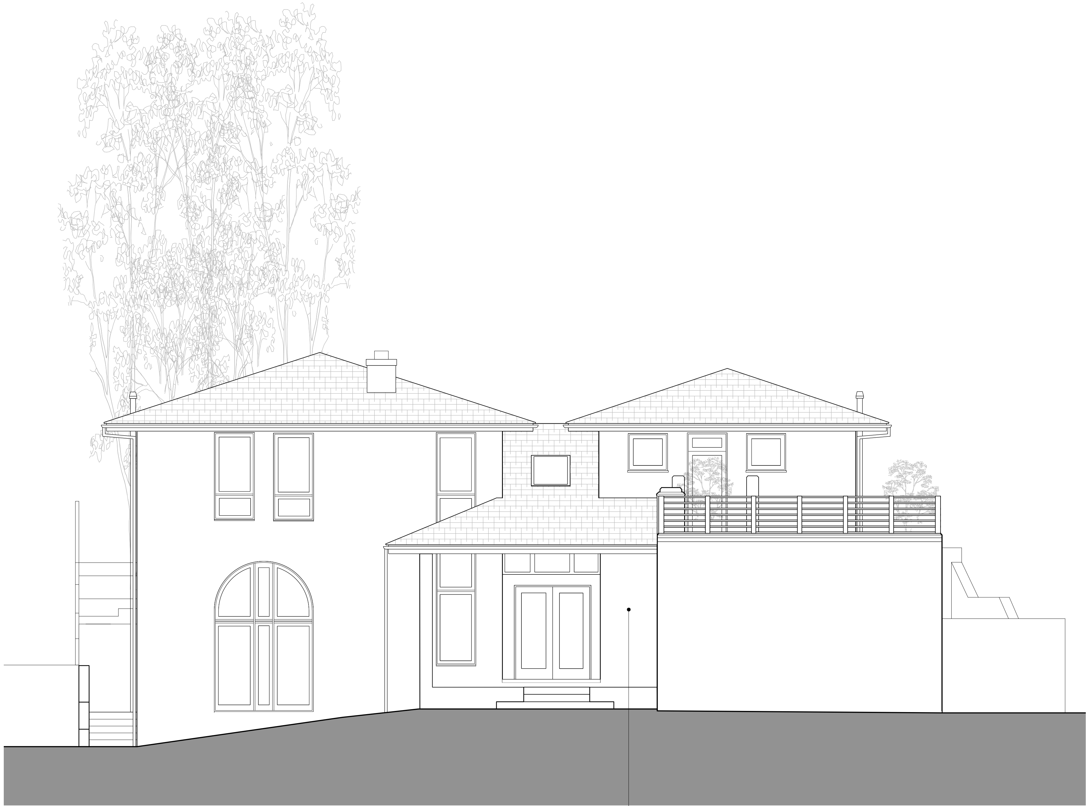
PROPOSED NORTH-EAST ELEVATION 1:50@A1 / 1:100@A3