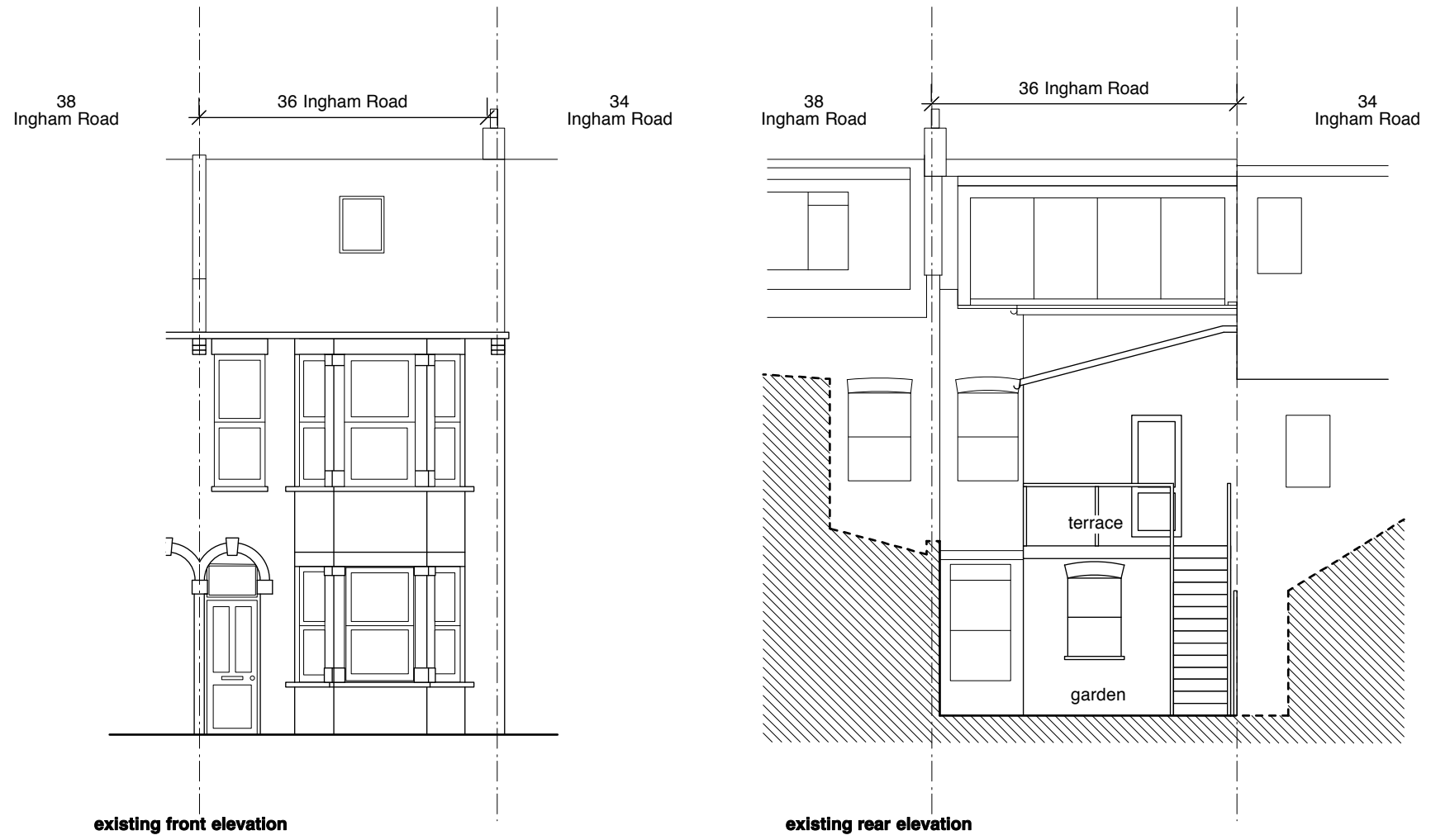
existing front elevation