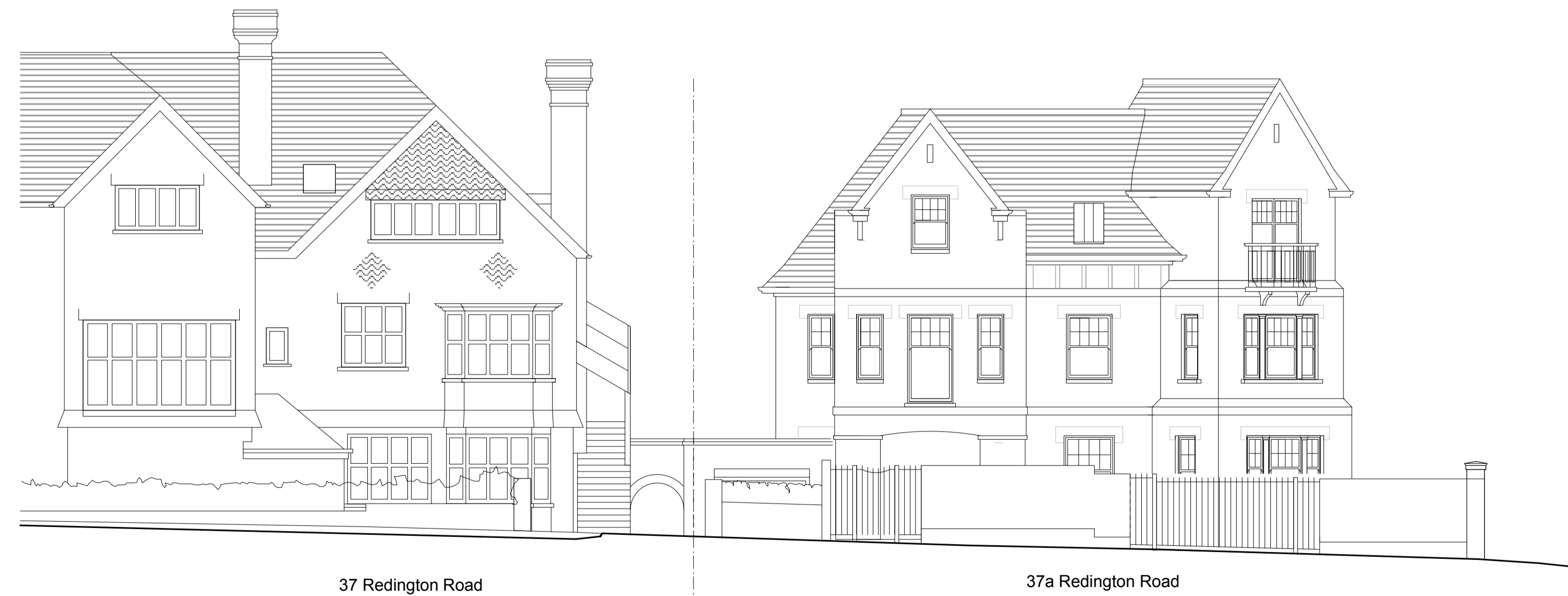
NORTH ELEVATION TO REDINGTON ROAD 1:100