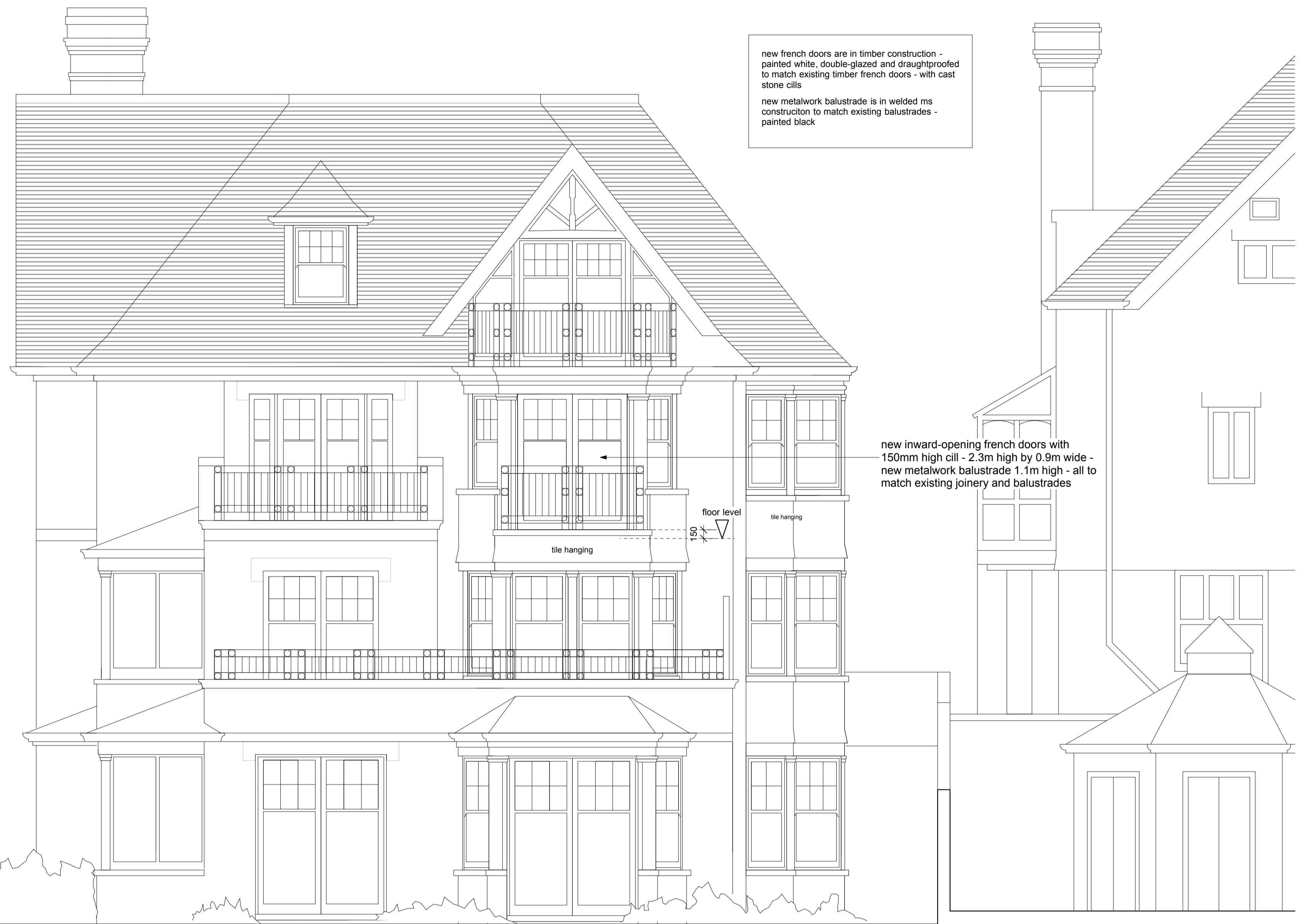
GARDEN (SOUTH) ELEVATION 1:50