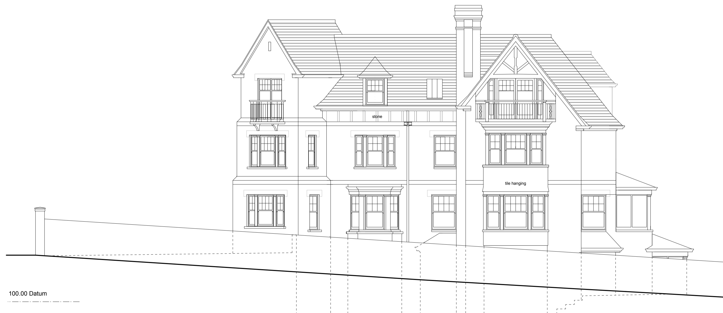
WEST ELEVATION TO OAKHILL AVENUE 1:100 no changes