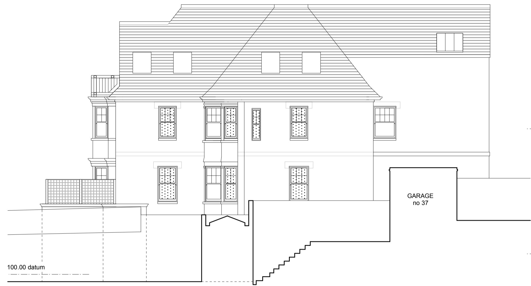
EAST ELEVATION 1:100 no changes