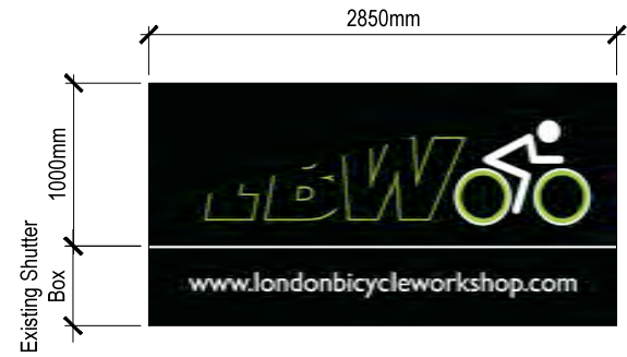
6. Proposed PVC Signage element no 1. Scale 1:50