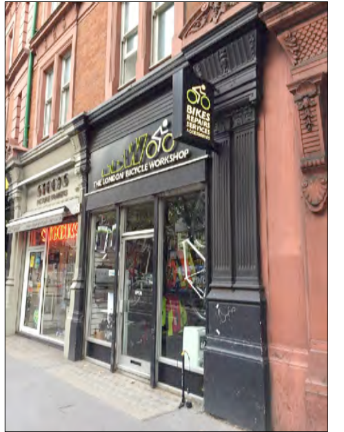
5. Precedents of the Shop fronts