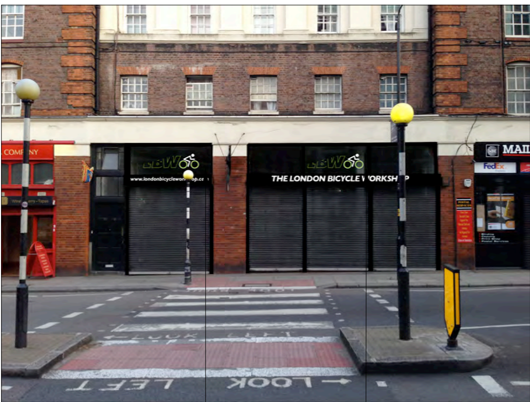
3. Proposed front view of the Shop front

Light-box in the position of the existing signage Size: H85mm x W56mm x D18.5mm