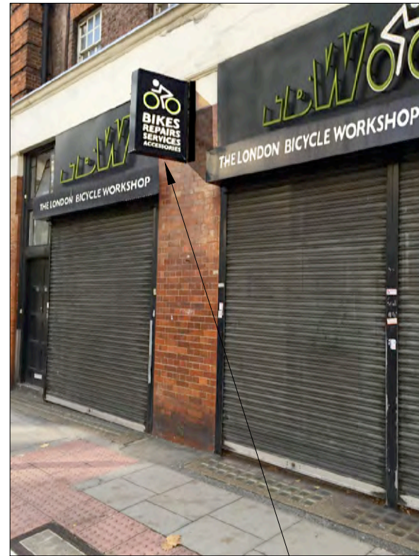
4. Proposed side view of the Shop front Not to scale