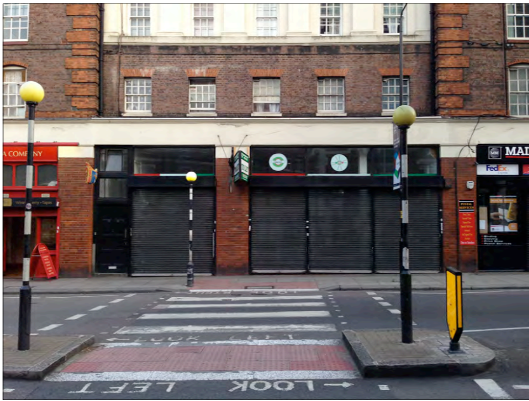
2. Existing front view of the Shop front Not to scale