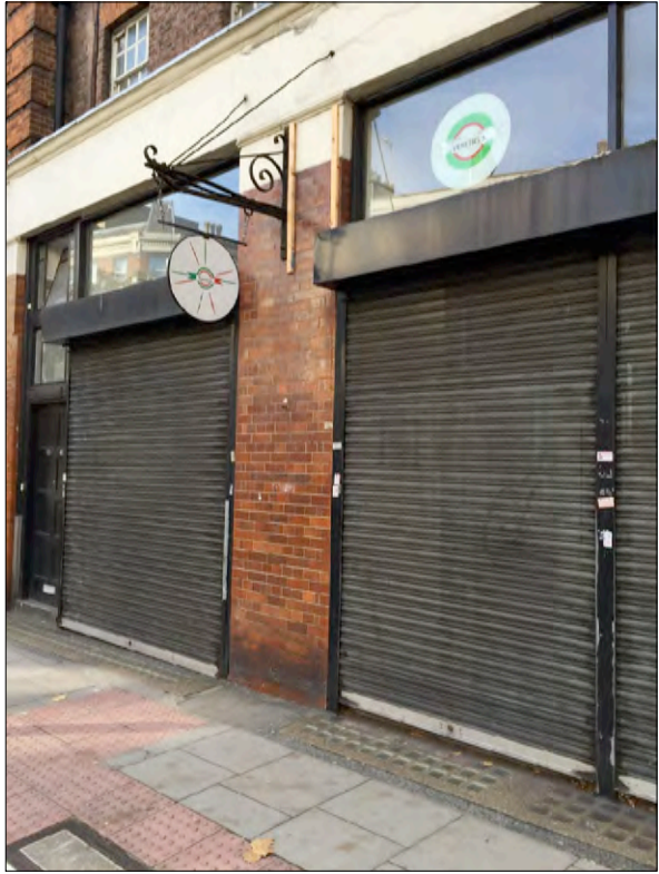
1. Existing side view of the Shop front Not to scale