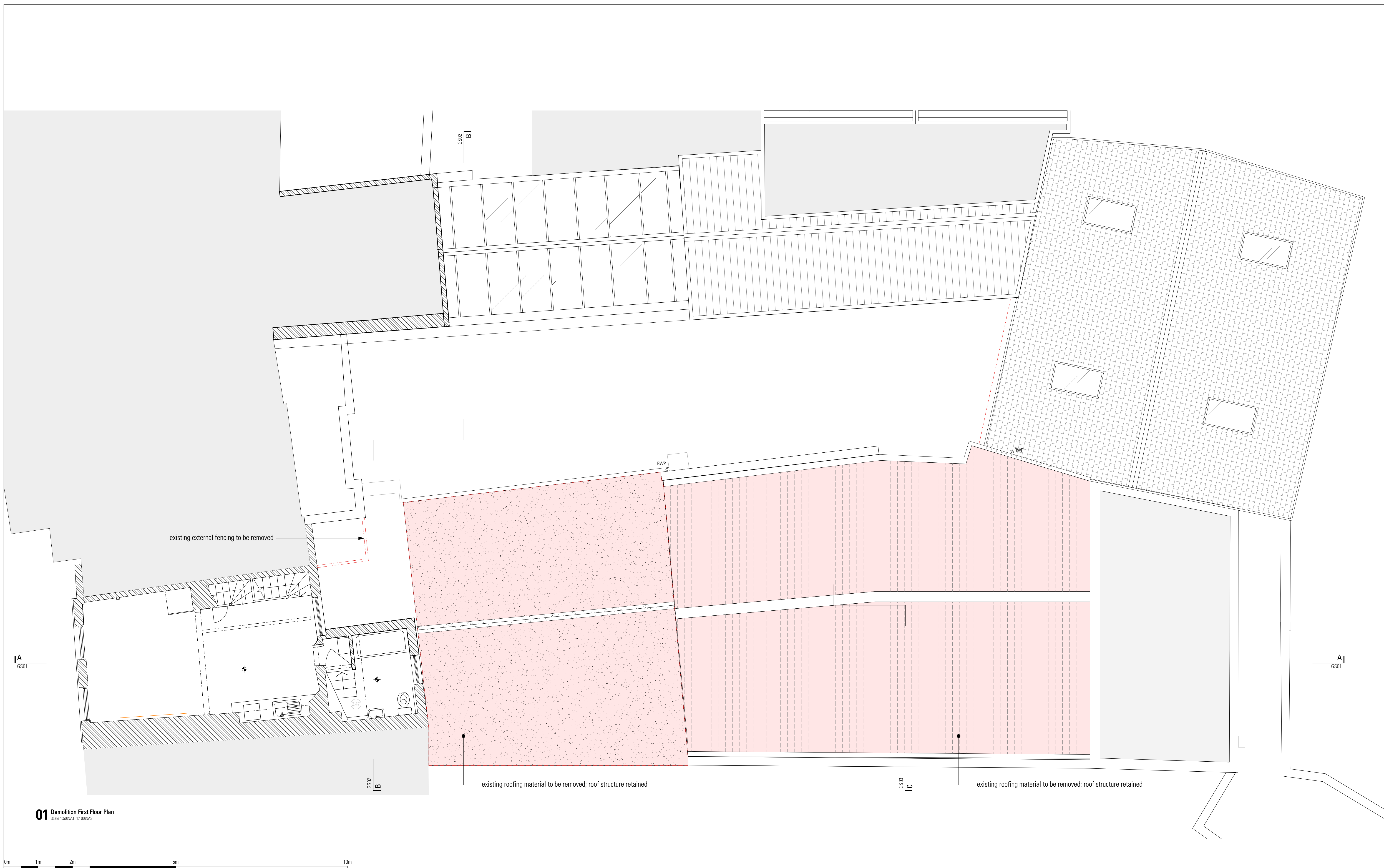
01 Demolition First Floor Plan Scale 1:50@A1, 1:100@A3