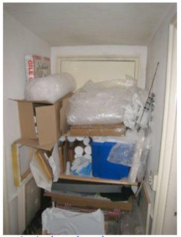
water tank cupboard