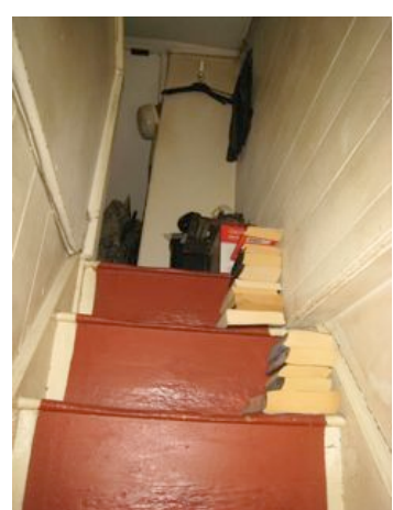
staircase to attic room