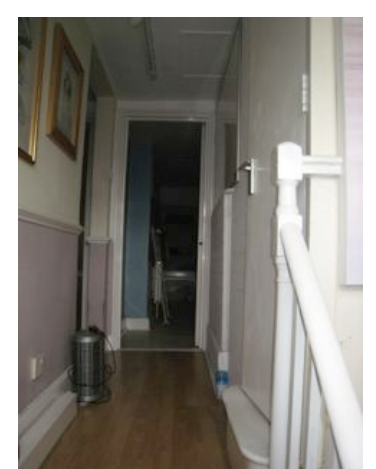
hall - view towards bathroom