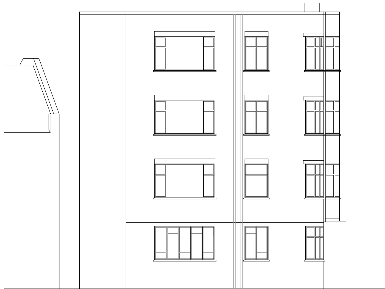
WEECH ROAD ELEVATION (existing)