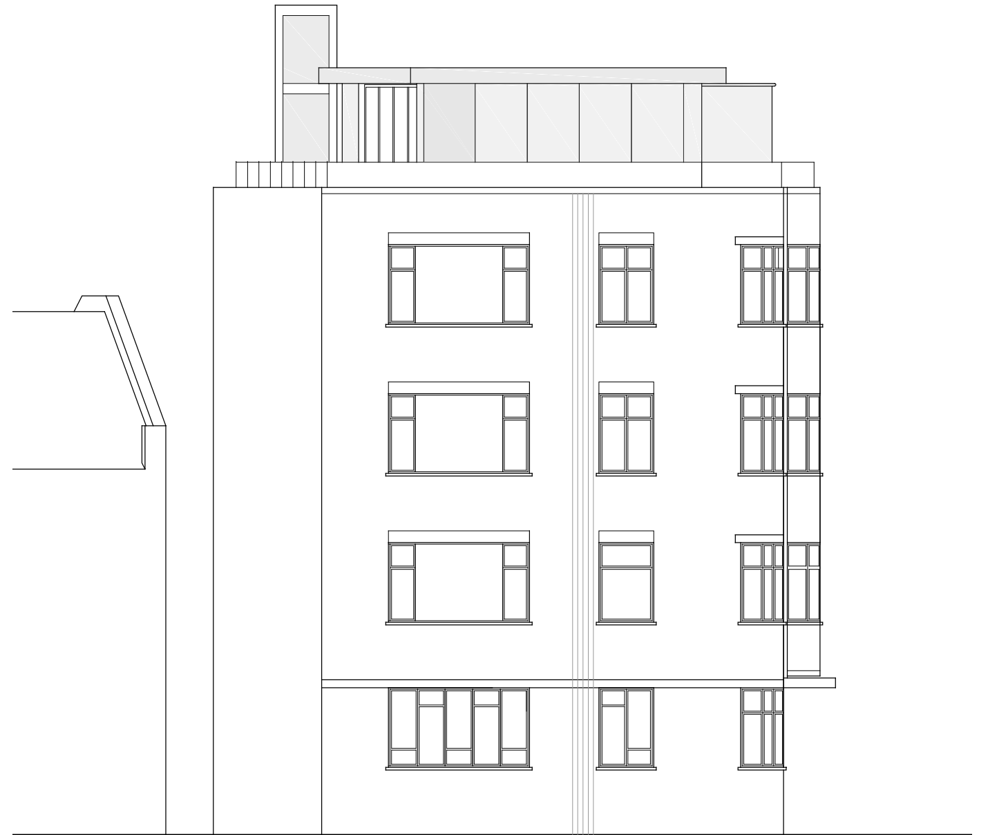
WEECH RD ELEVATION (proposed)