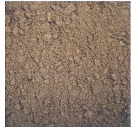
OLD ENGLISH SELF BINDING GRAVEL