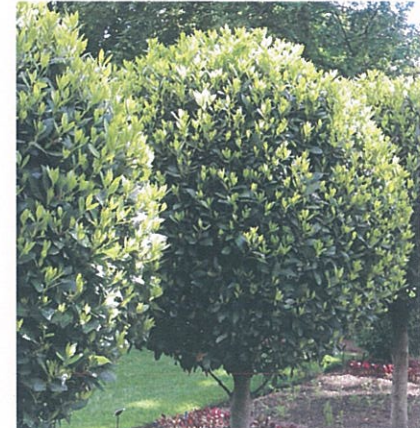
CLIPPED BAY TREE'S