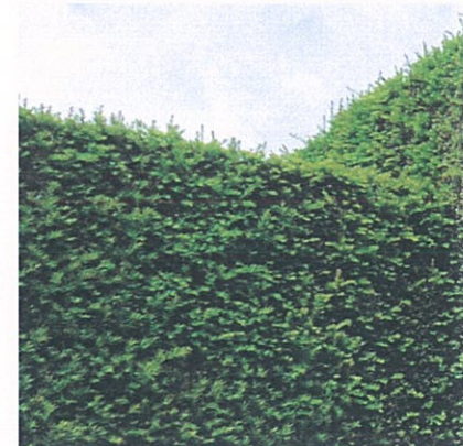
TAXUS BACCATTA HEDGE