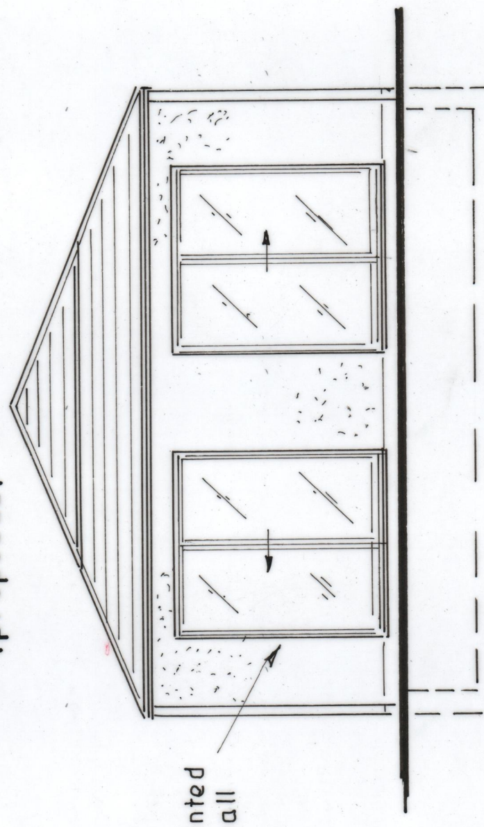
REAR ELEVATION (proposed)