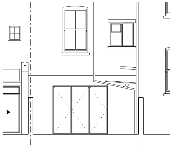
REAR ELEVATION - EXISTING