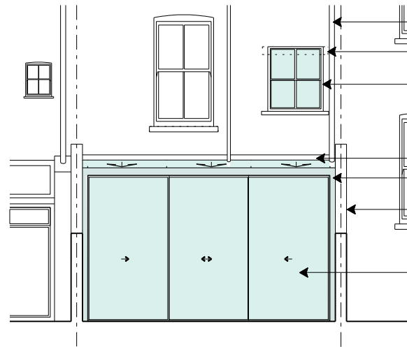
REAR ELEVATION - PROPOSED