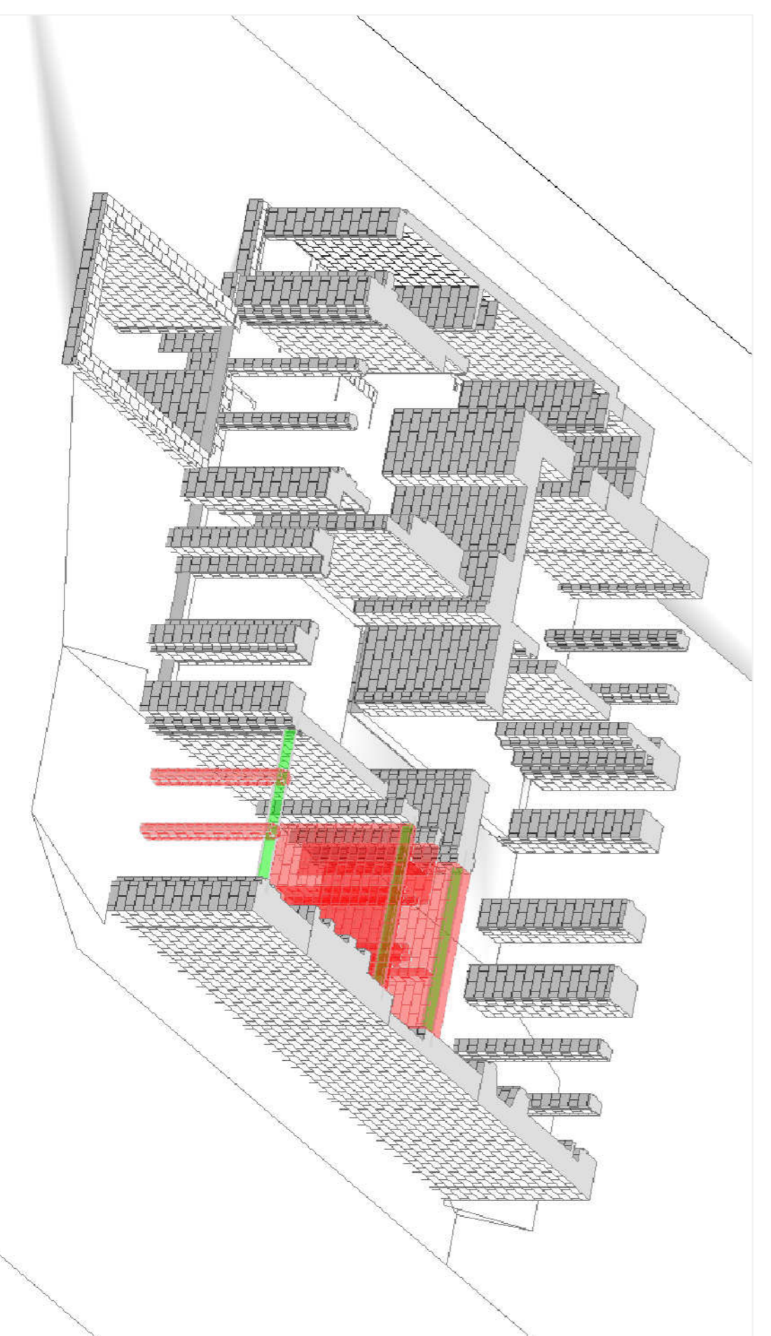
3D VIEW FROM FRONT OF BUILDING