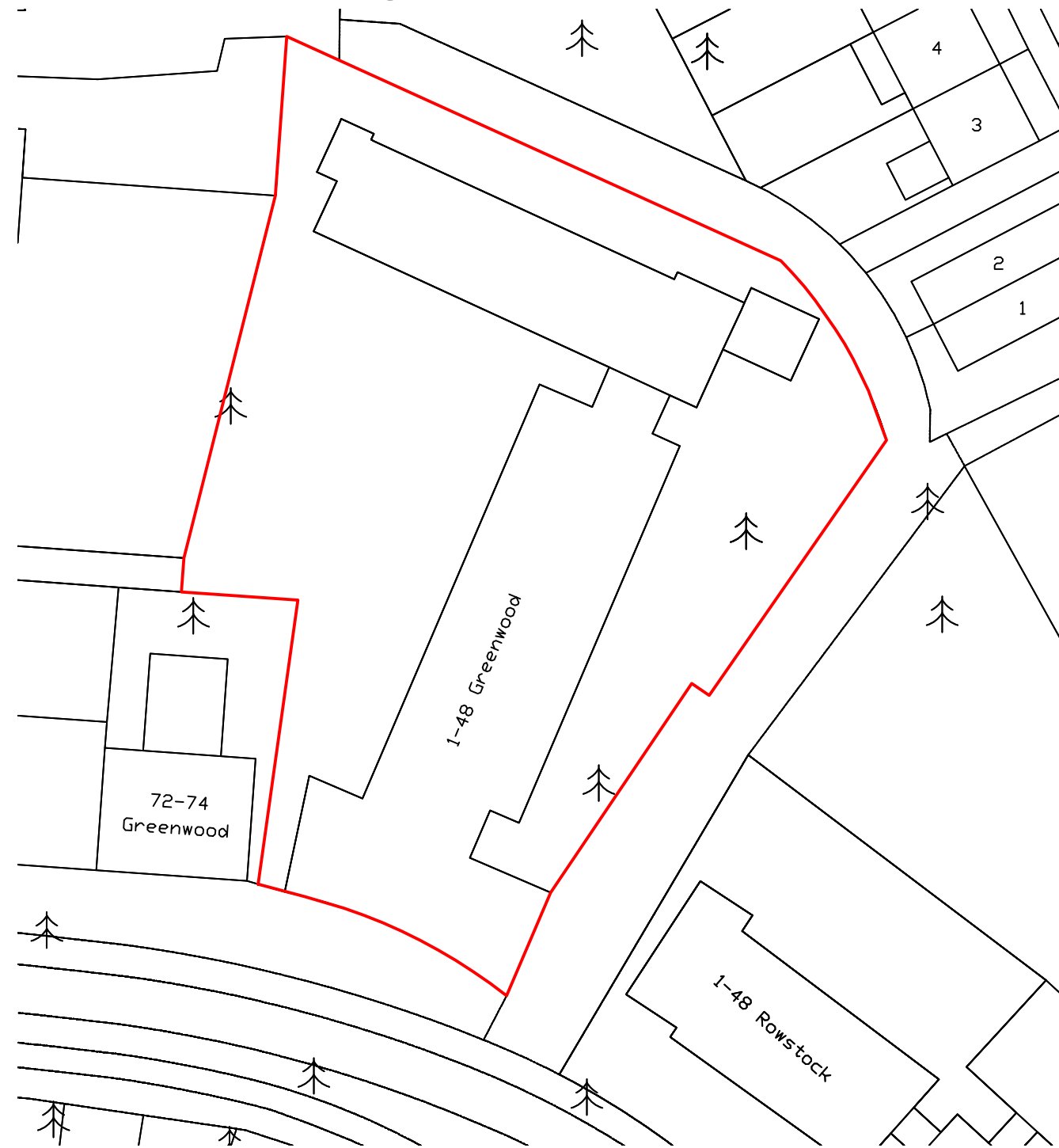
Site Plan - 1:500 @ A3