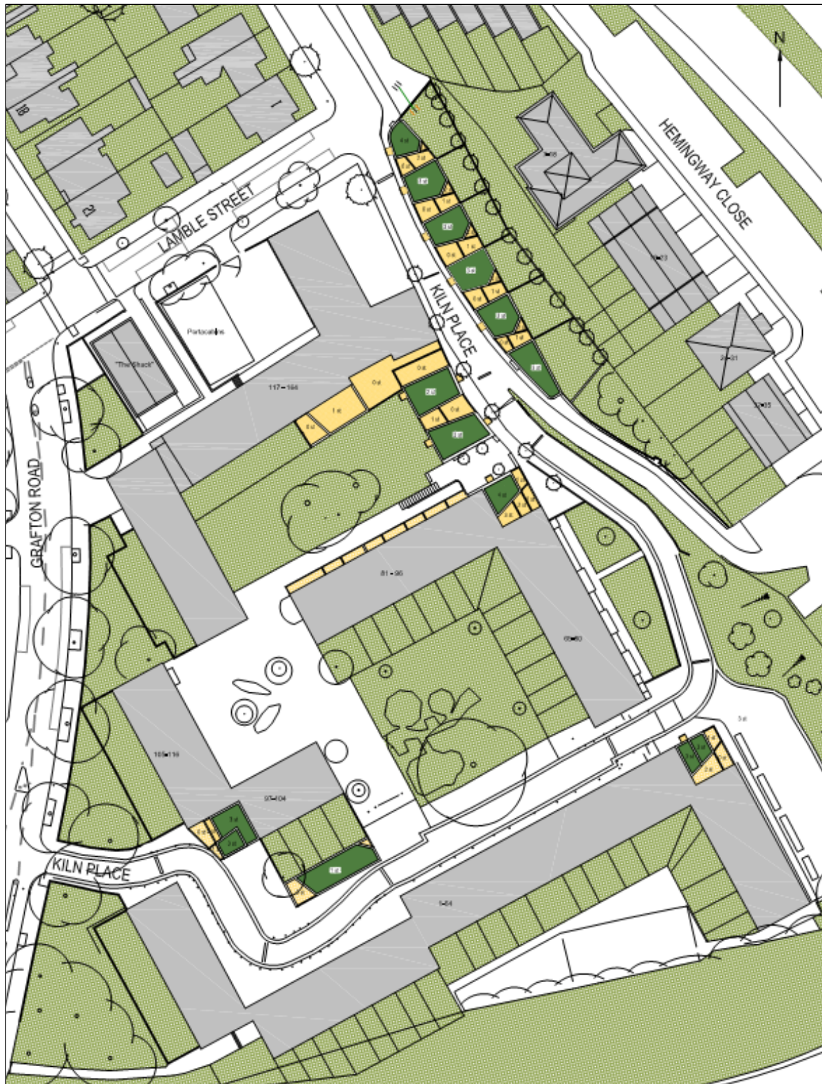
Figure 1 Kiln Place site plan