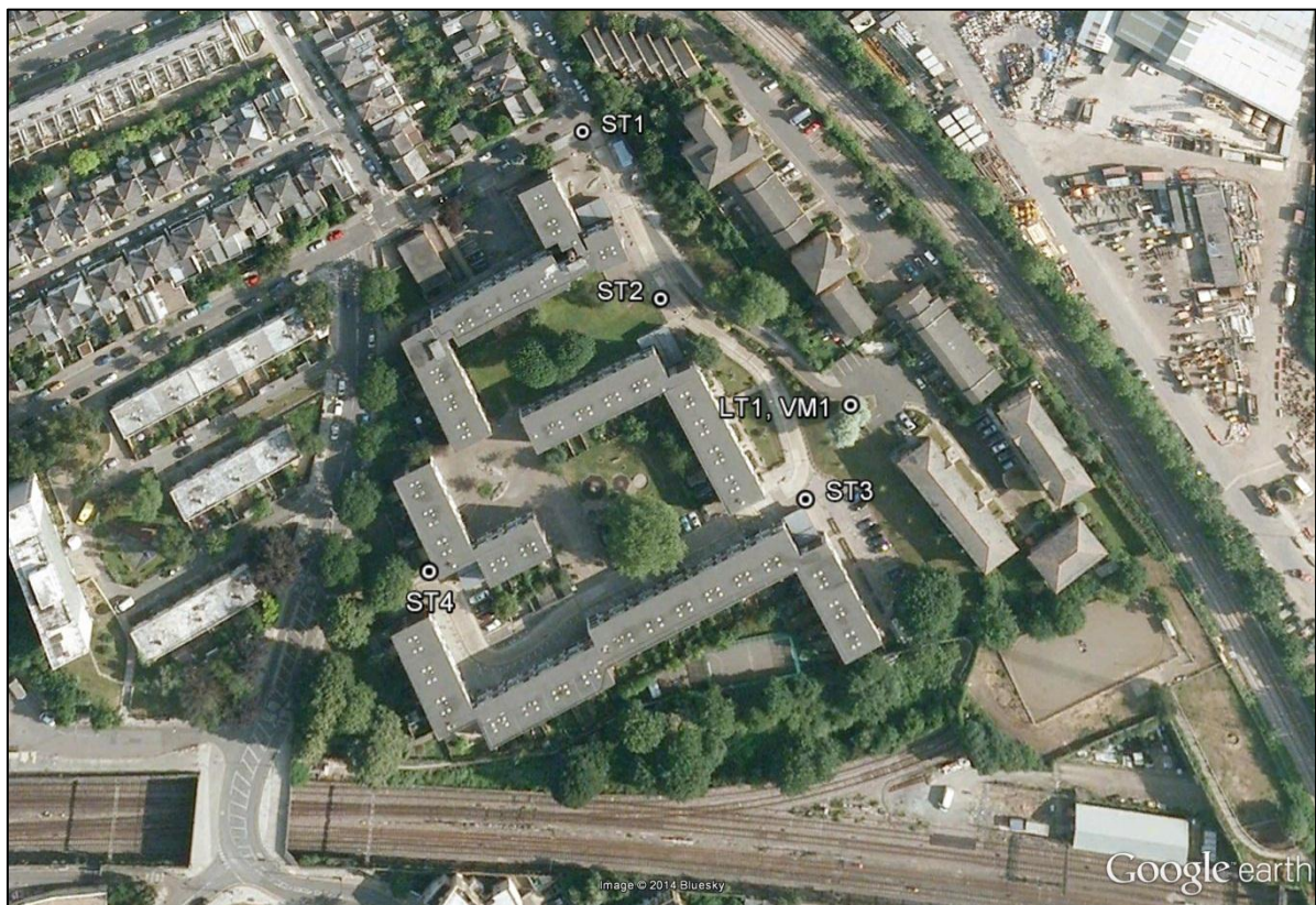
Figure 2 Noise monitoring locations