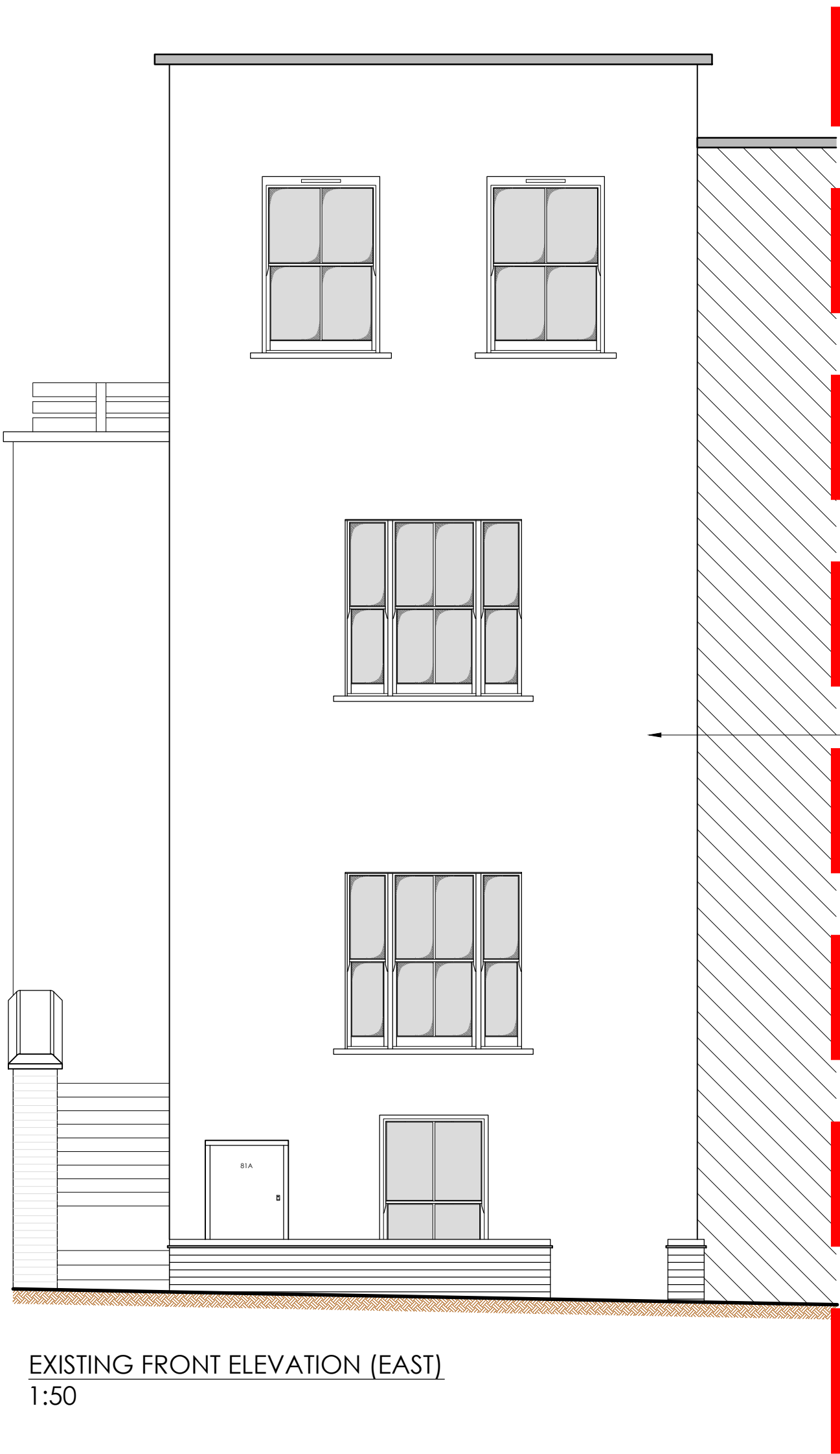
EXISTING FRONT ELEVATION (EAST) 1:50