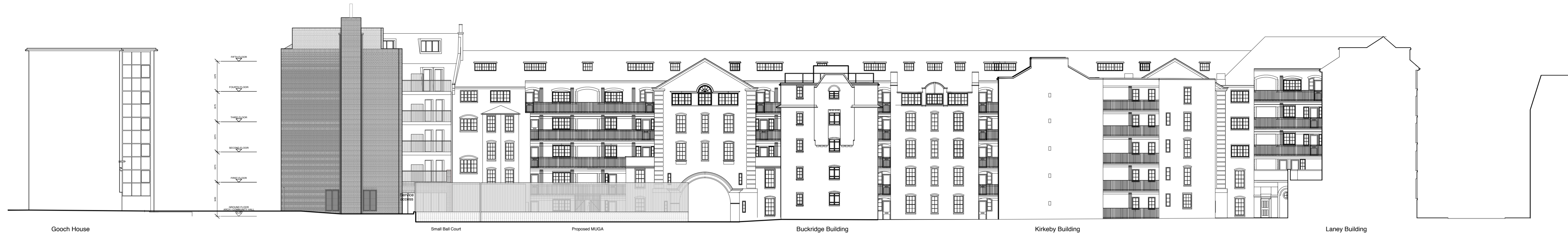
Gooch House Small Ball Court Proposed MUGA Buckridge Building Kirkeby Building Laney Building