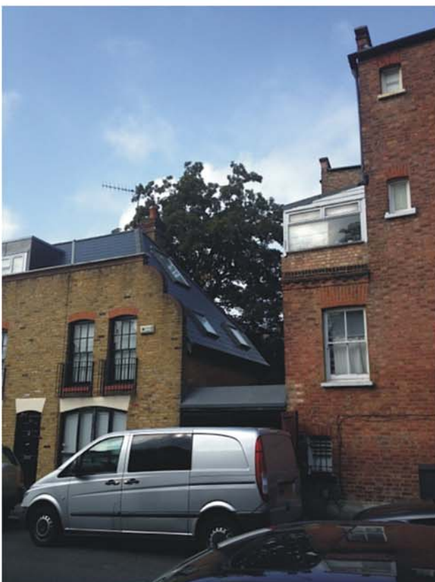
Photograph 9. View of the subject tree looking to the north-west