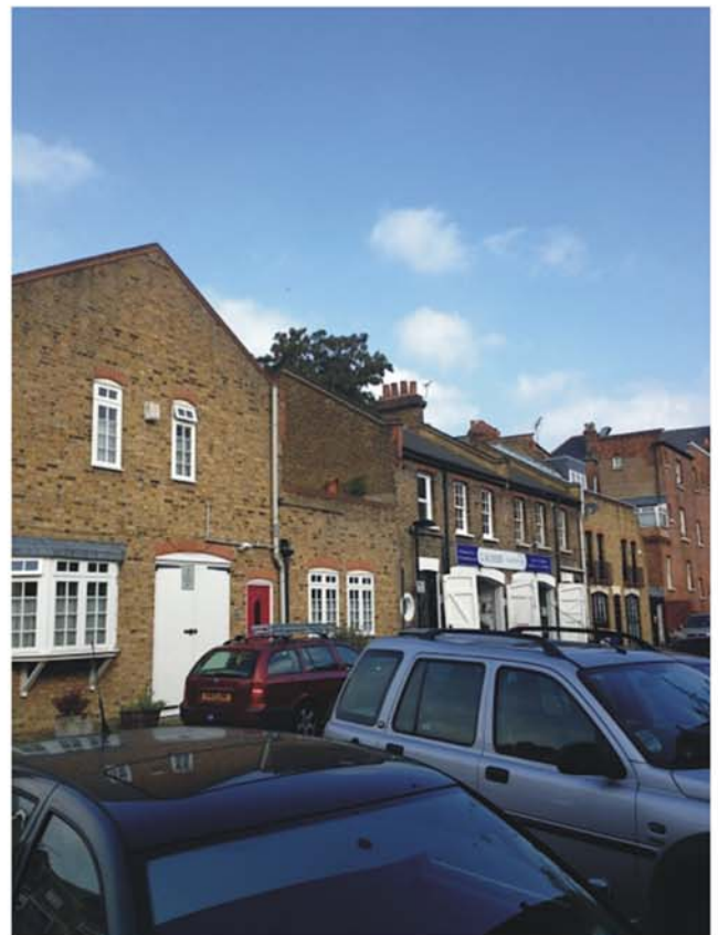
Photograph 10. View of the subject tree looking to the south-west