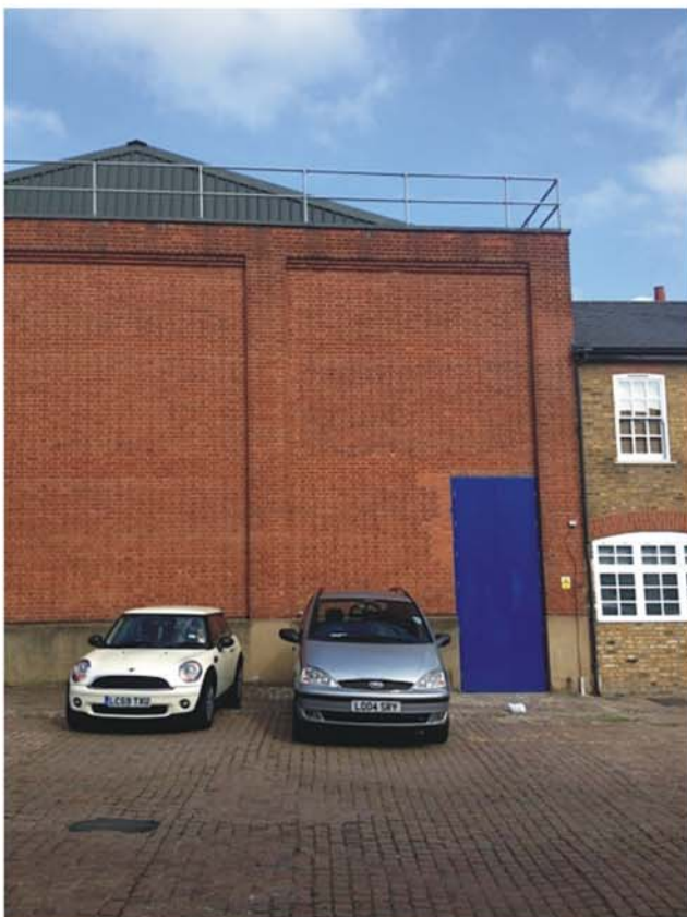
Photograph 12. View of the subject tree looking to the north