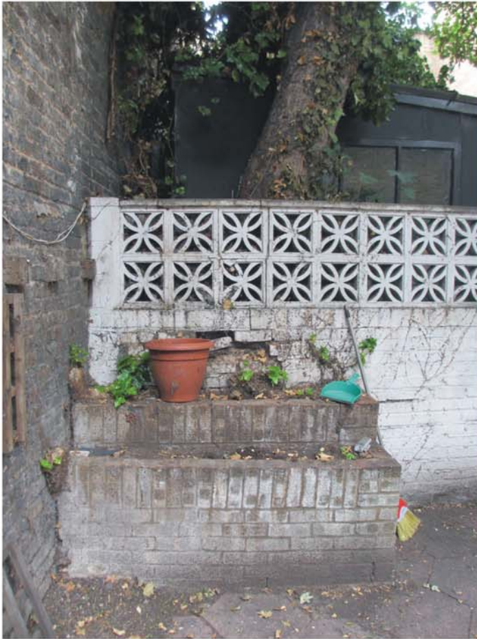
Photograph 7. View of the subject tree looking to the west showing the damage to the boundary wall.