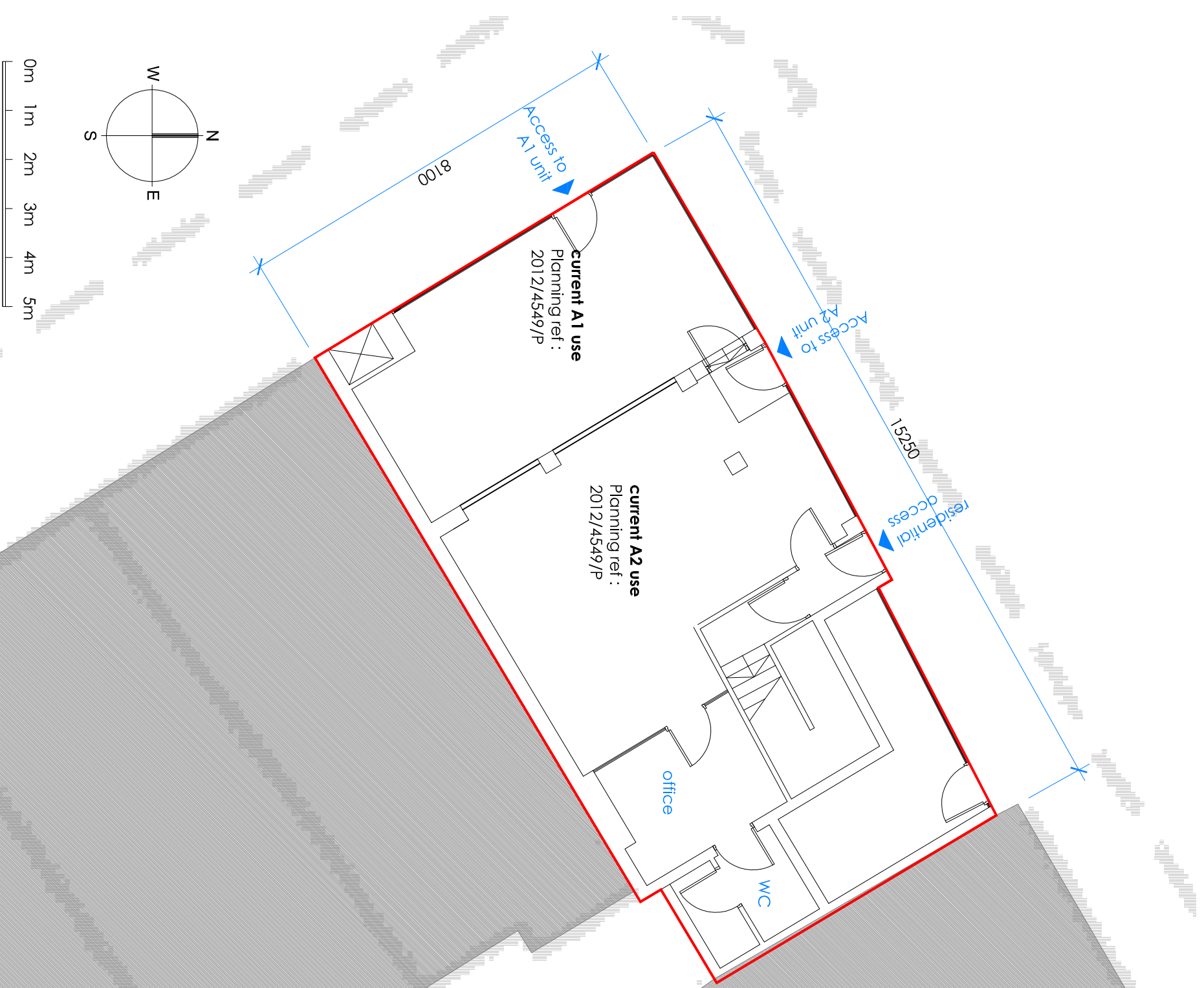
FLOOR PLAN - ORIGINAL (ARRANGEMENT AT PRESENT) 1:100