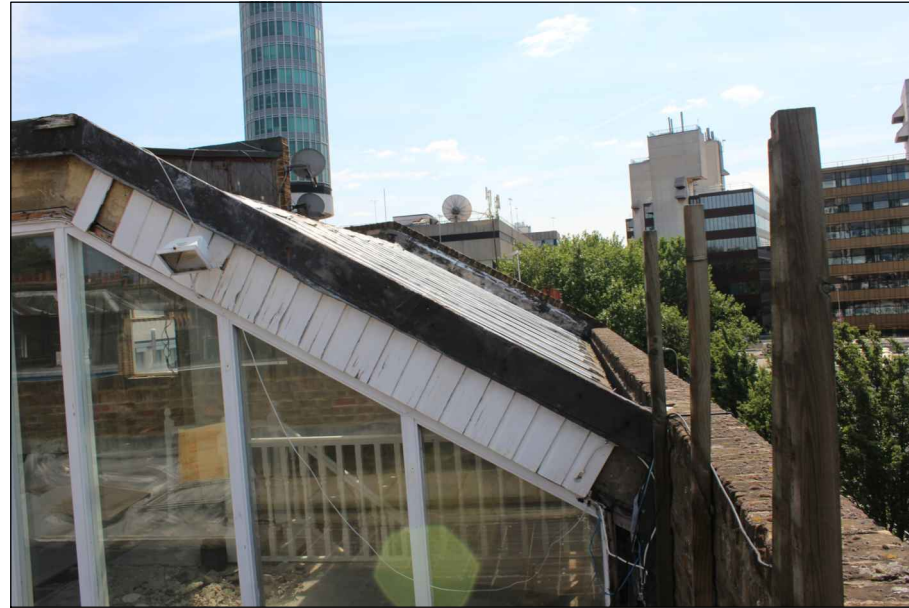
Fourth Floor Glazed Roof