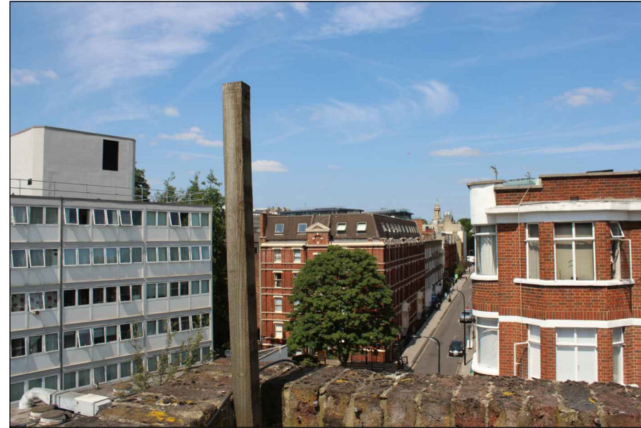
View along Cleveland Street