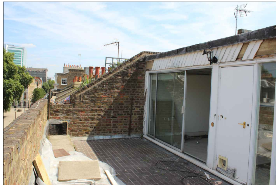
Fourth Floor Terrace looking North