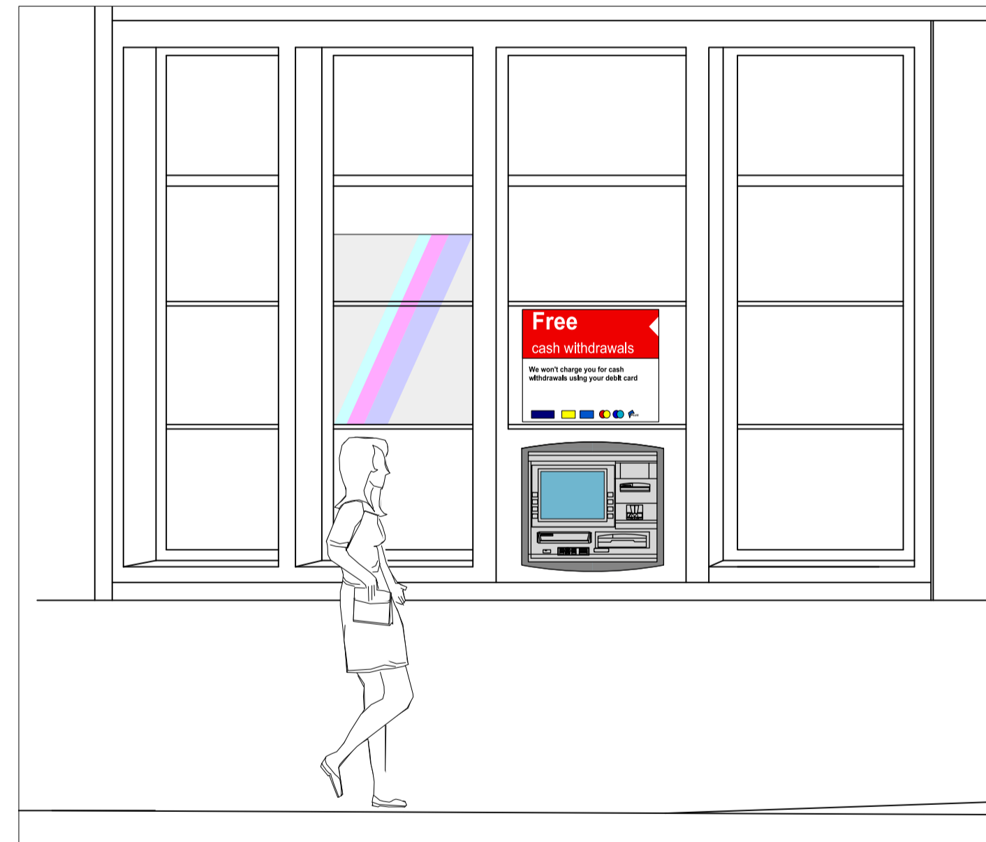
CAMDEN TOWN DETAILED ELEVATION OF AFFECTED AREA (scale 1:25) @ A1