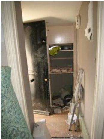
basement flat entrance