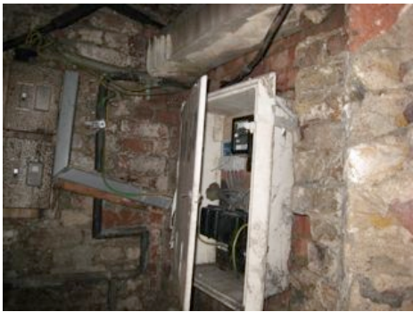
electrical switchgear and meters within vault