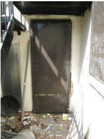
basement flat entrance