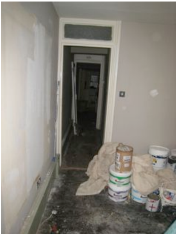
basement flat - view towards back extension kitchen