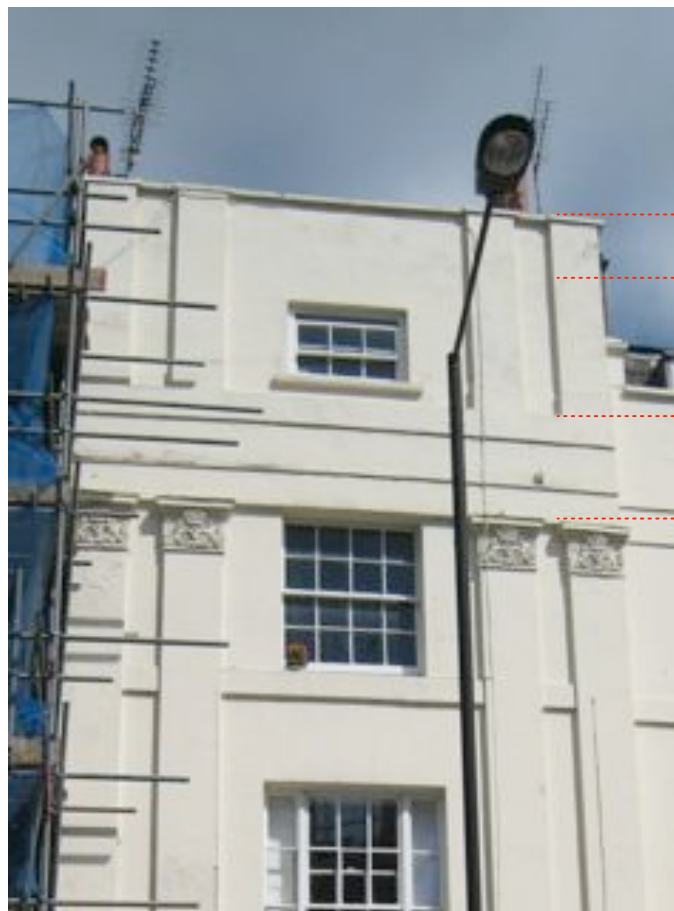
26 FREDERICK STREET - with incomplete entablature and missing cornice