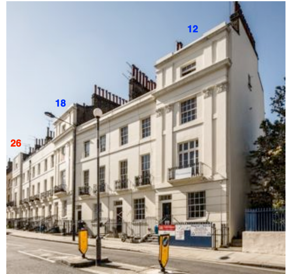
12-26 FREDERICK STREET

Rusticated stucco ground floor and plain stucco 1st floor sill bands. Square-headed doorway with panelled jamb, cornice-head, fanlight and panelled door.