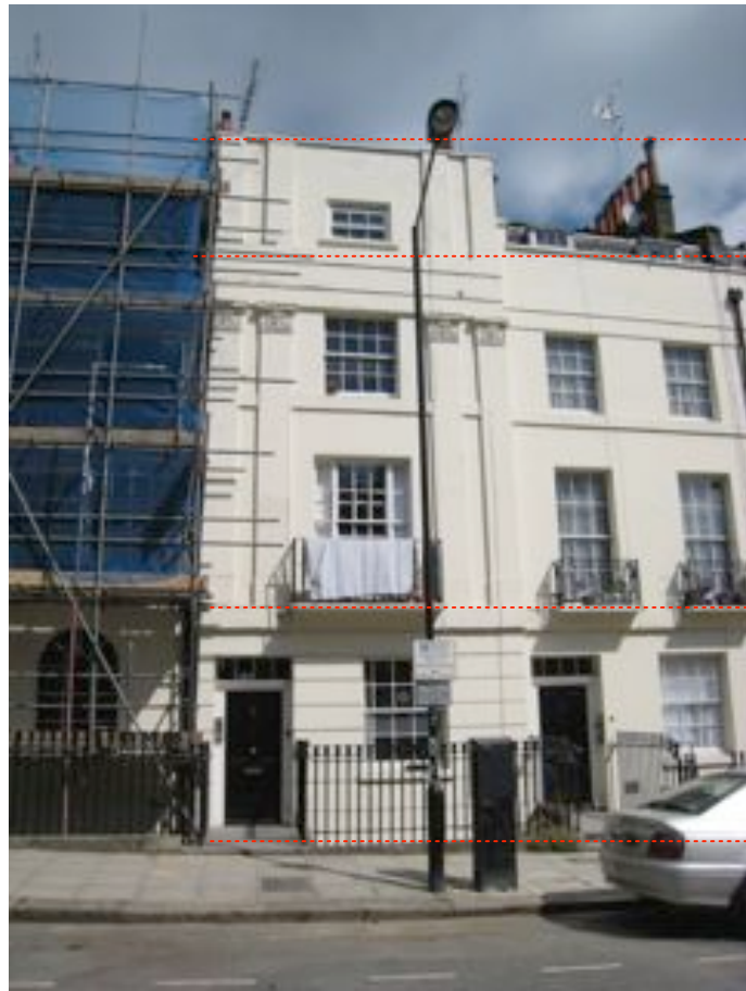
26 FREDERICK STREET FRONT ELEVATION