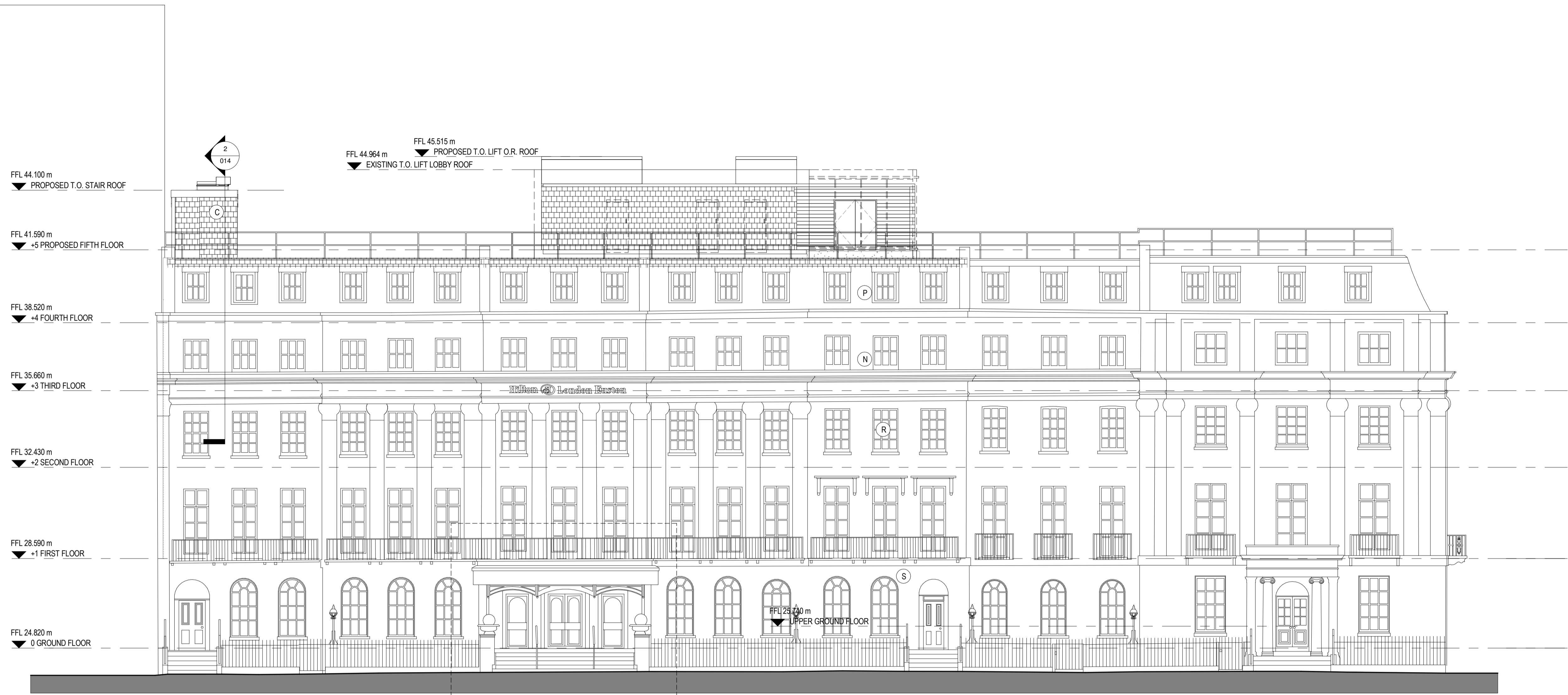
1 NORTH EAST ELEVATION, UPPER WOBURN PLACE 1:100

Canopy, external doors and lift access all subject to separate planning application 2014/5206/P & 2014/5438/NEW