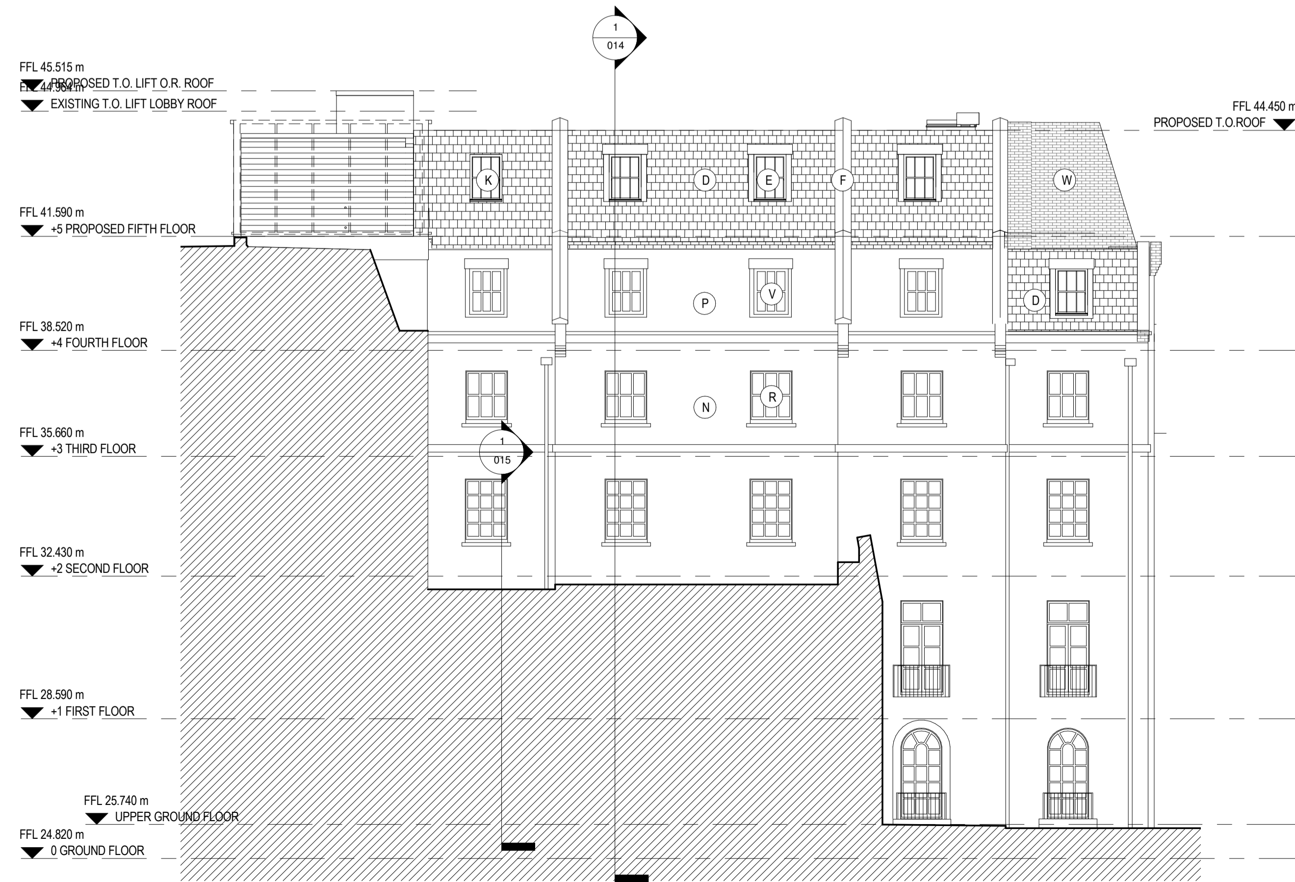
2 NORTH WEST ELEVATION 1:100

Canopy, external doors and lift access all subject to separate planning application 2014/5206/P & 2014/5438/NEW