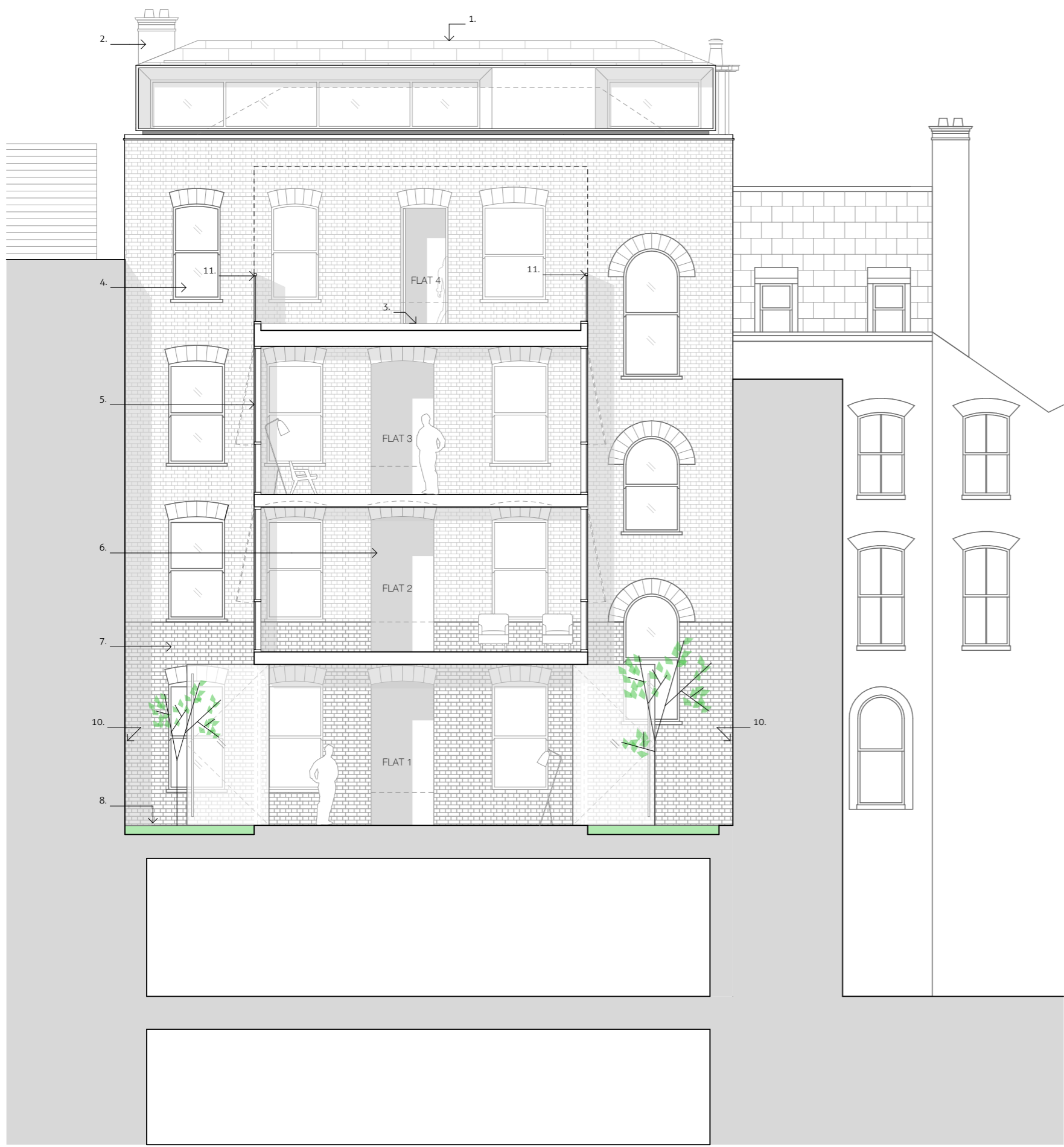
REAR ELEVATION SECTION C-C

This drawing is the Copy right of LATIS limited. This drawing has been produced electronically and may have been photo reduced or enlarged when copied. Do not scale from drawing. Work only to figured dimensions This drawing is to be read in conjunction with relevant consultants and engineers drawings and specifications.